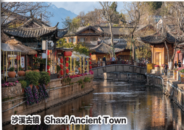
沙溪古镇 Shaxi Ancient Town