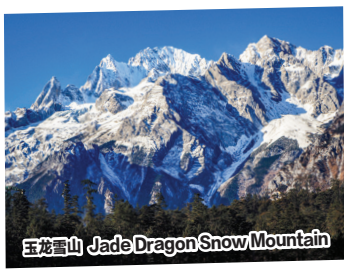
玉龙雪山 Jade Dragon Snow Mountain