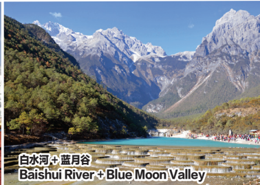
白水河 + 蓝月谷 Baishui River + Blue Moon Valley