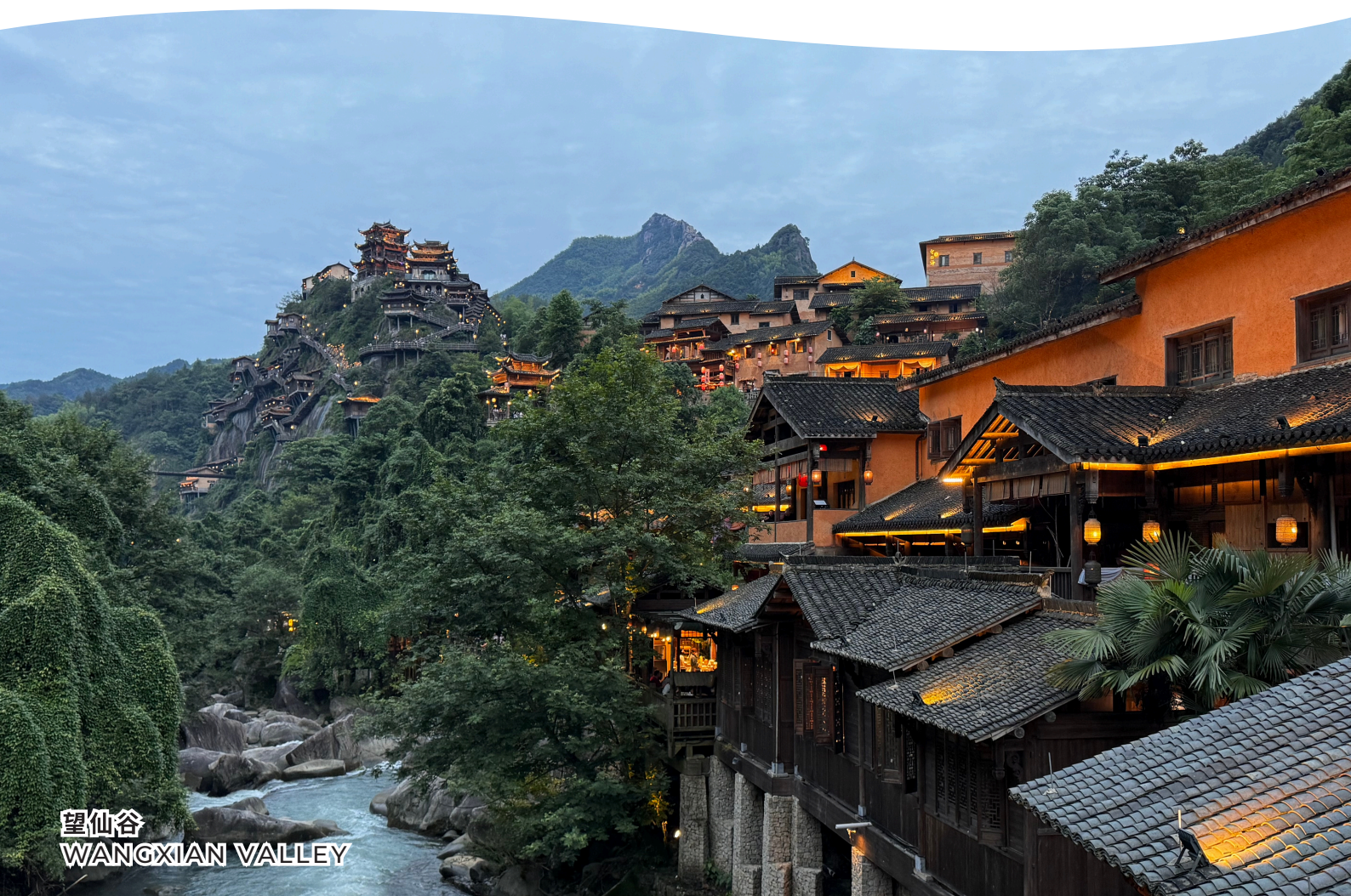
望仙谷 WANGXIAN VALLEY