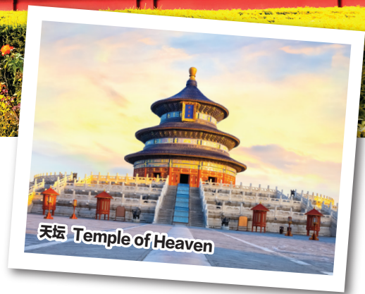
天坛 Temple of Heaven