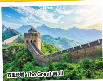
万里长城 The Great Wall