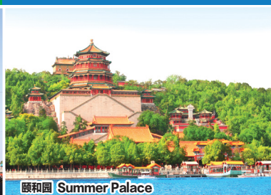
颐和园 Summer Palace