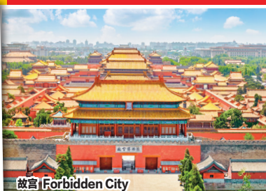
故宫 Forbidden City