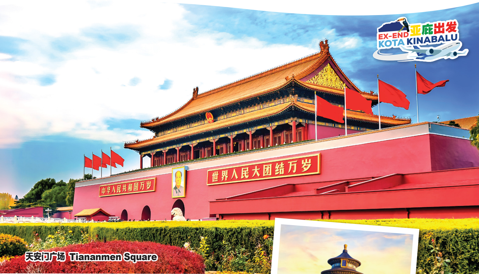
天安门广场 Tiananmen Square