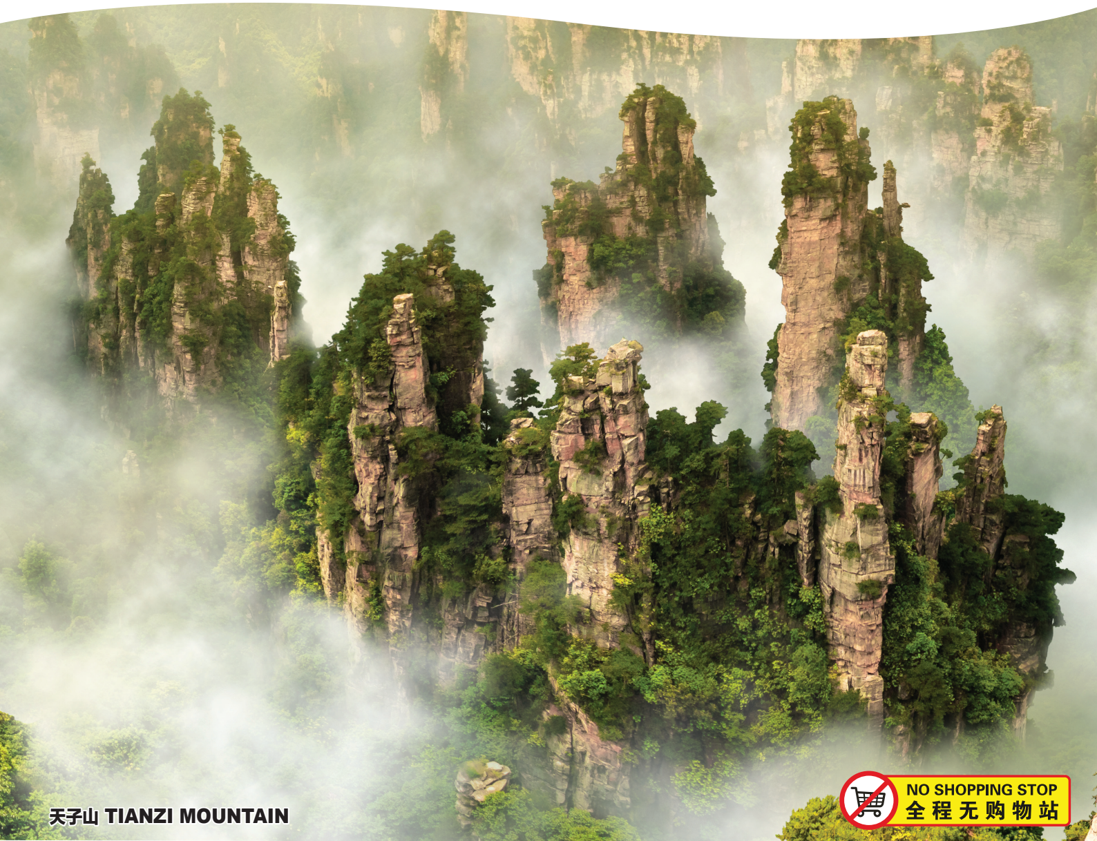
天子山 TIANZI MOUNTAIN