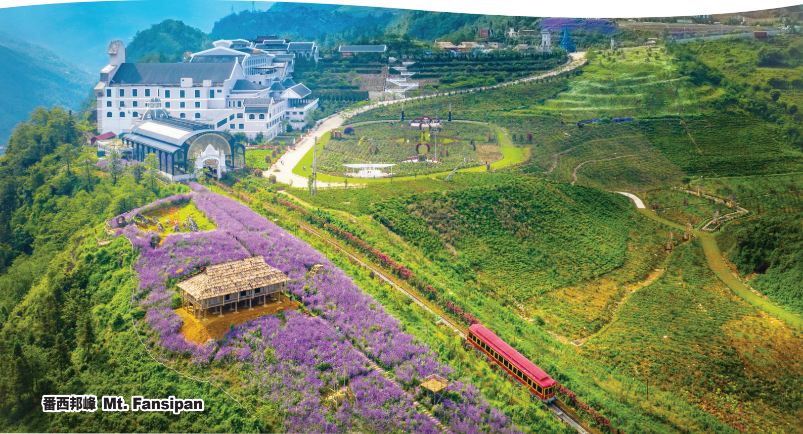
番西邦峰 Mt. Fansipan