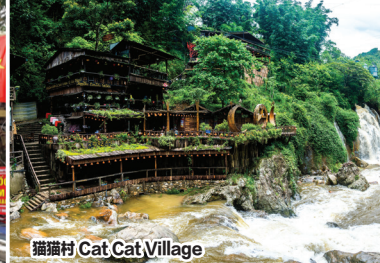
猫猫村 Cat Cat Village