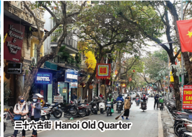
三十六古街 Hanoi Old Quarter