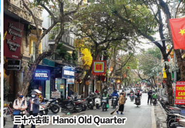
三十六古街 Hanoi Old Quarter