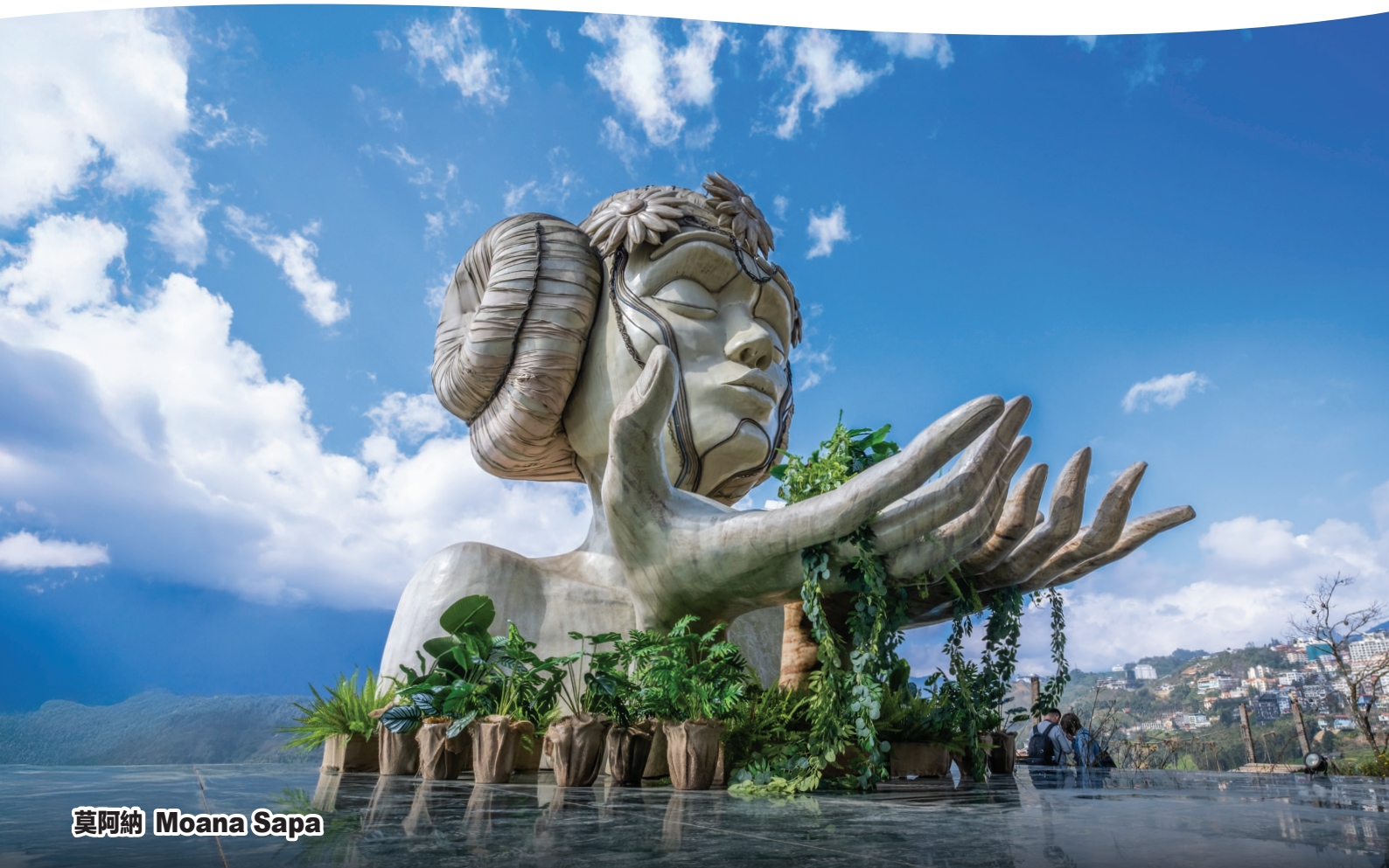
莫阿納 Moana Sapa