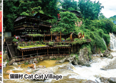
猫猫村 Cat Cat Village