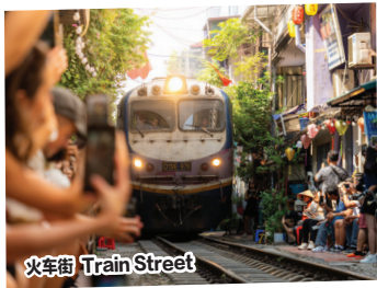
火车街 Train Street