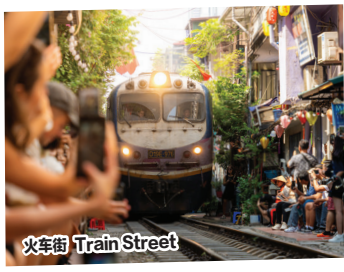
火车街 Train Street