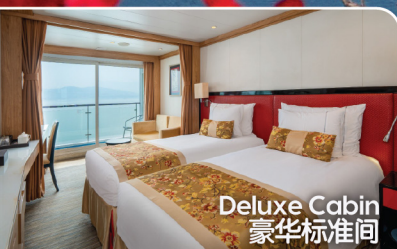
Deluxe Cabin 豪华标准间