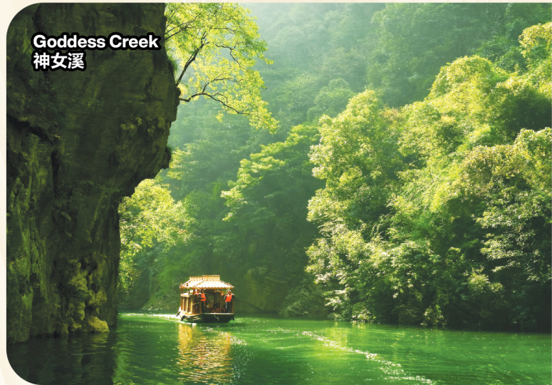
Goddess Creek 神女溪