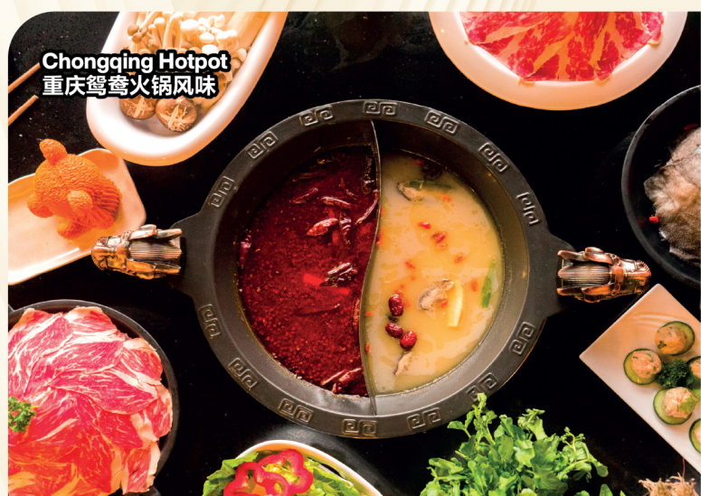
Chongqing Hotpot 重庆鸳鸯火锅风味