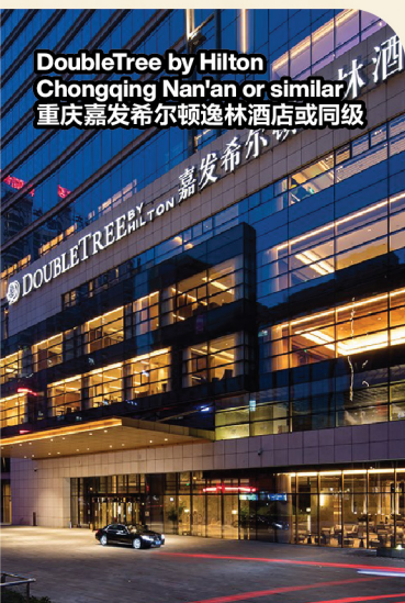
DoubleTree by Hilton Chongqing Nan'an or similar 重庆嘉发希尔顿逸林酒店或同级