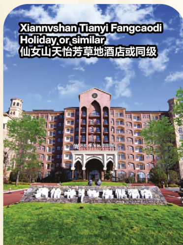
Xiannvshan Tianyi Fangcaodi Holiday or similar 仙女山天怡芳草草地酒店或同级