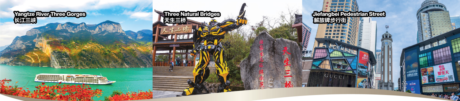
Yangtze River Three Gorges 长江三峡