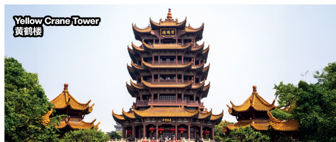
Yellow Crane Tower 黄鹤楼