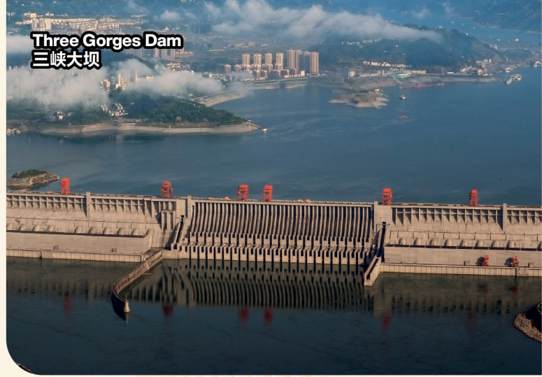
Three Gorges Dam 三峡大坝