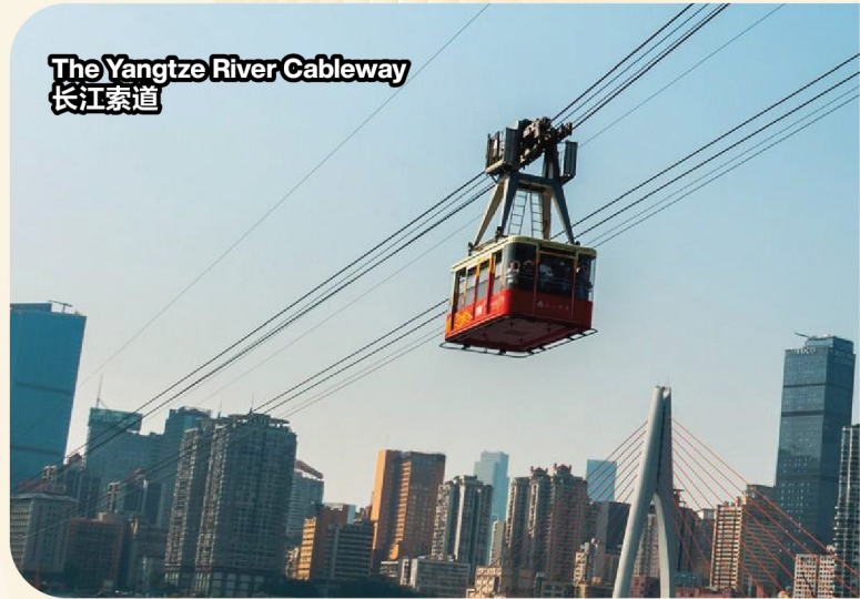
The Yangtze River Cableway 长江索道