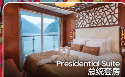
Presidential Suite 总统套房

** Stateroom images for reference only; actual layout may vary. 客房图片仅供参考，实际布局可能有所不同。