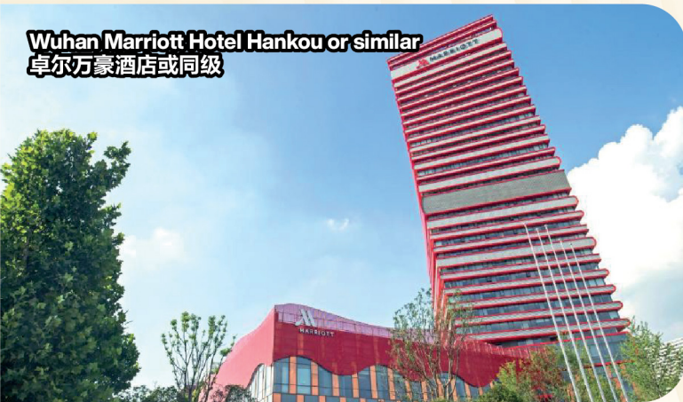
Wuhan Marriott Hotel Hankou or similar 卓尔万豪酒店或同级