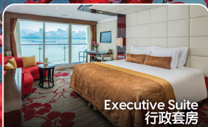
Executive Suite 行政套房