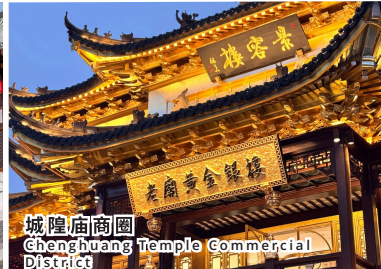
城隍庙商圈 Chenghuang Temple Commercial District