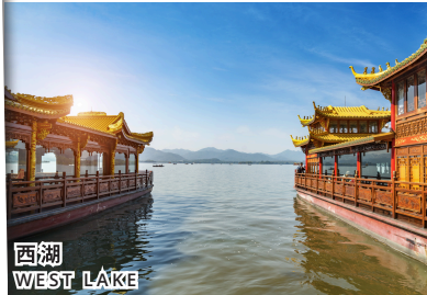
西湖 WEST LAKE