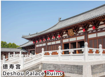
德寿宫 Deshou Palace Ruins