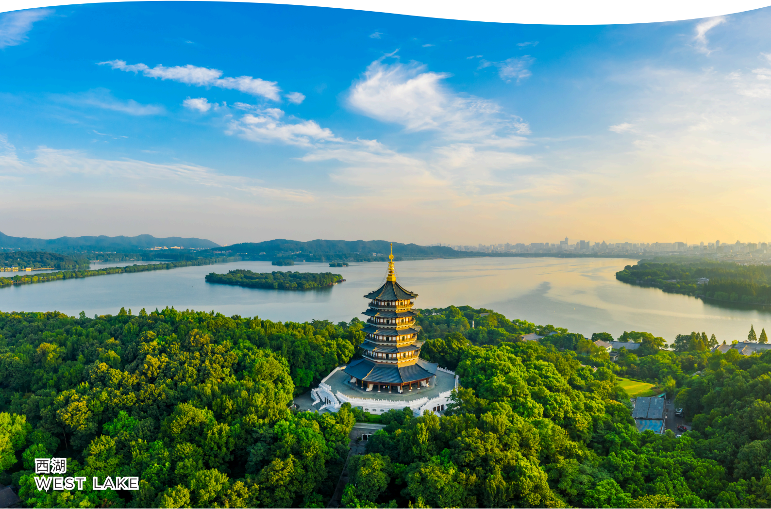
西湖 WEST LAKE