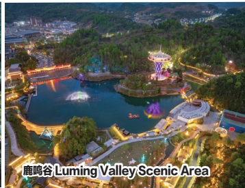
鹿鸣谷 Luming Valley Scenic Area