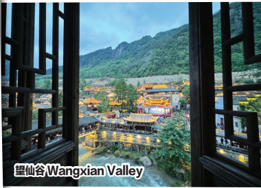
望仙谷 Wangxian Valley