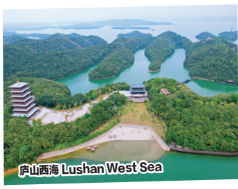
庐山西海 Lushan West Sea