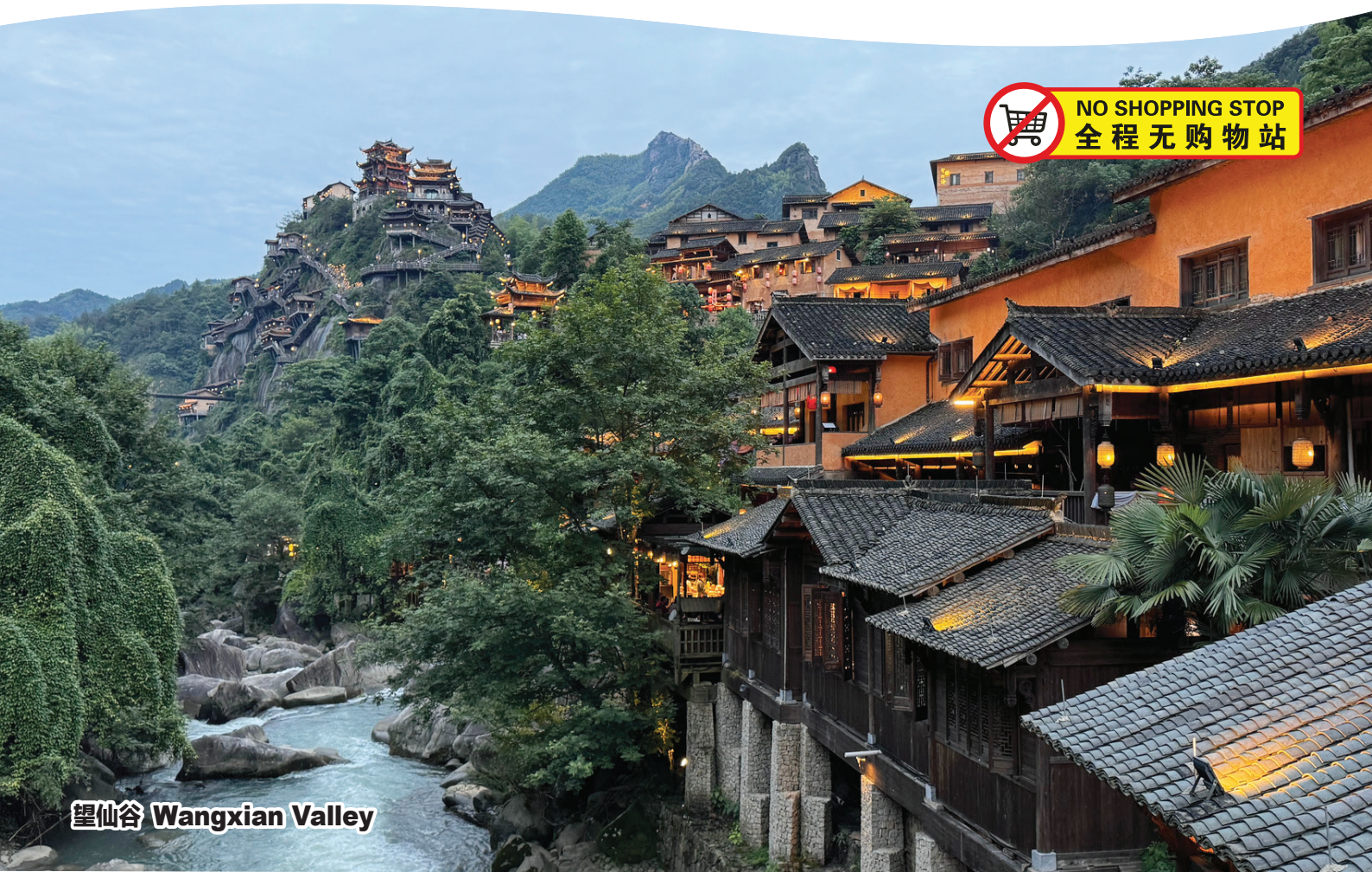
望仙谷 Wangxian Valley