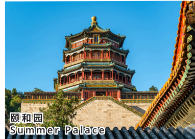
颐和园 Summer Palace