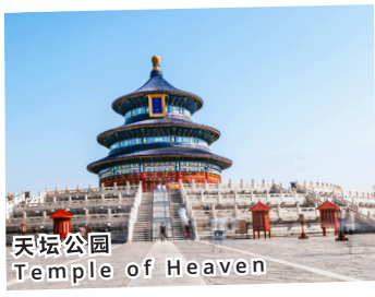
天坛公园 Temple of Heaven