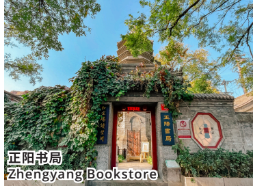
正阳书局 Zhengyang Bookstore