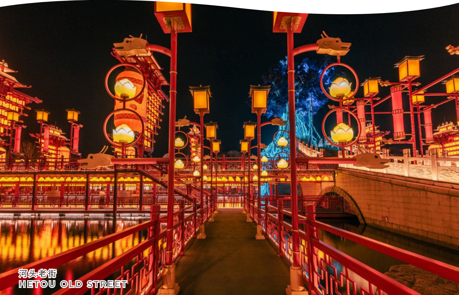
河头老街 HETOU OLD STREET