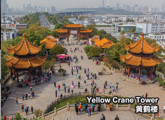
Yellow Crane Tower 黄鹤楼