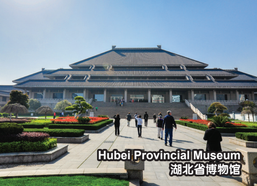
Hubei Provincial Museum 湖北省博物馆