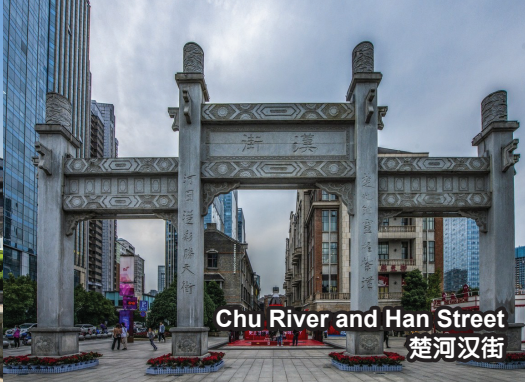
Chu River and Han Street 楚河汉街