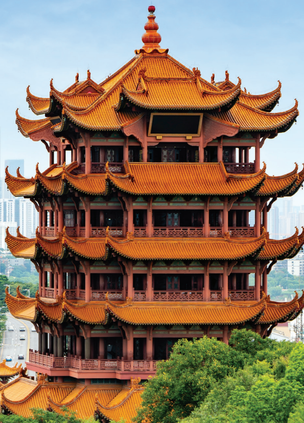
Yellow Crane Tower 黄鹤楼