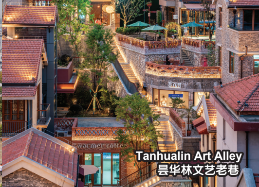
Tanhualin Art Alley 昙华林文艺老巷