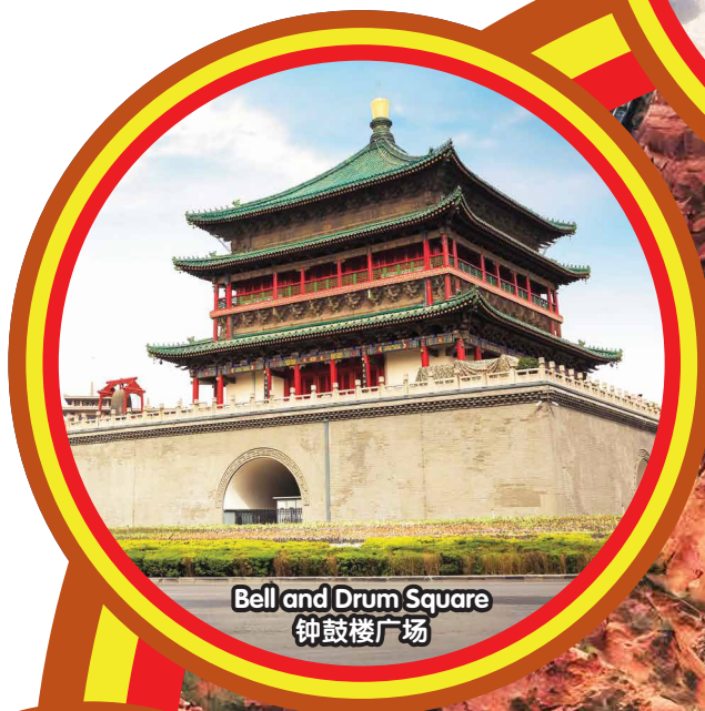
Bell and Drum Square 钟鼓楼广场