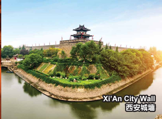
Xi'an City Wall 西安城墙