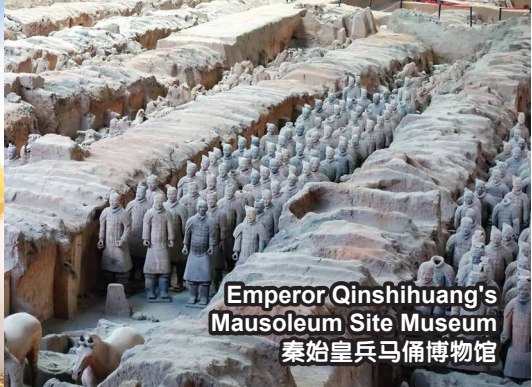
Emperor Qinshihuang's Mausoleum Site Museum 秦始皇兵马俑博物馆