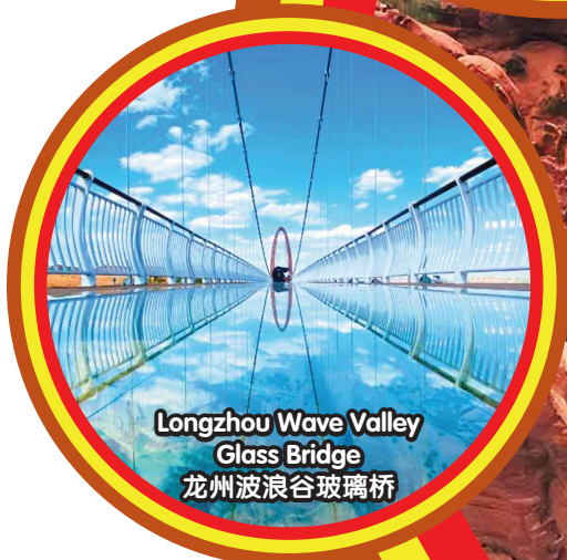
Longzhou Wave Valley Glass Bridge 龙州波浪谷玻璃桥

行程次序，以当地旅社安排为准。 Sequences of Itinerary are subject to local arrangement.