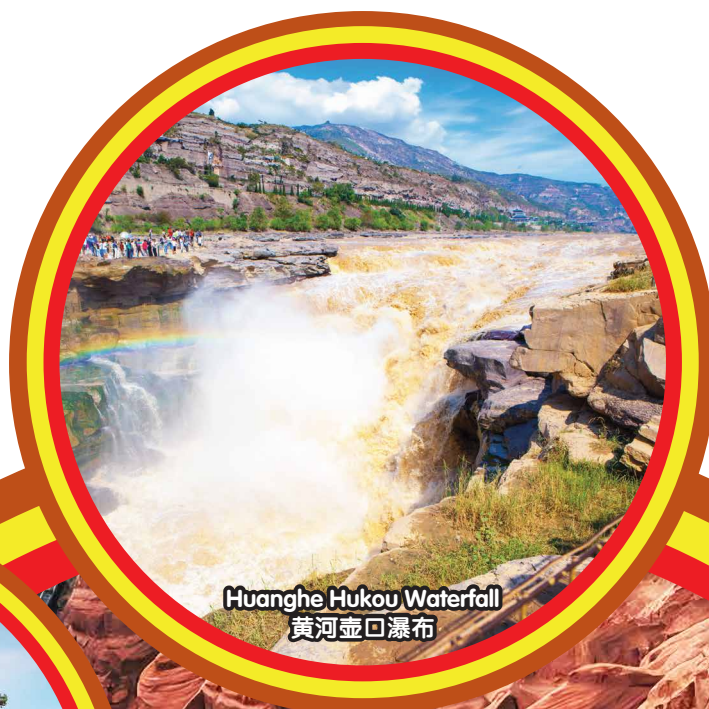
Huanghe Hukou Waterfall 黄河壶口瀑布