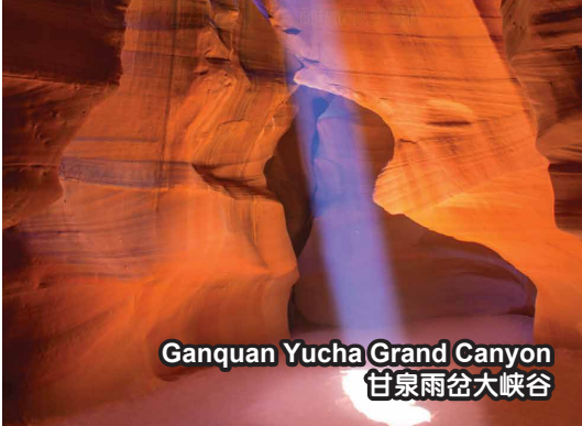
Ganquan Yucha Grand Canyon 甘泉雨岔大峡谷