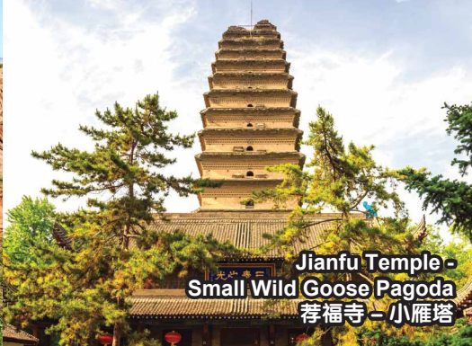
Jianfu Temple - Small Wild Goose Pagoda 荐福寺 - 小雁塔