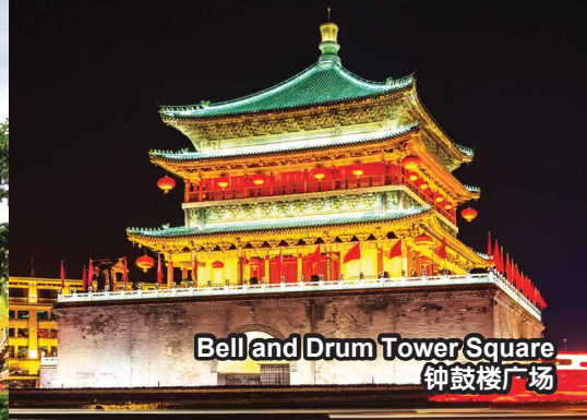
Bell and Drum Tower Square 钟鼓楼广场