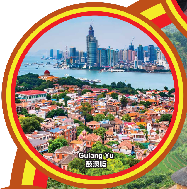
Gulang Yu 鼓浪屿