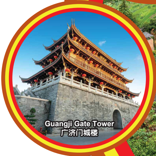
Guangji Gate Tower 广济门城楼