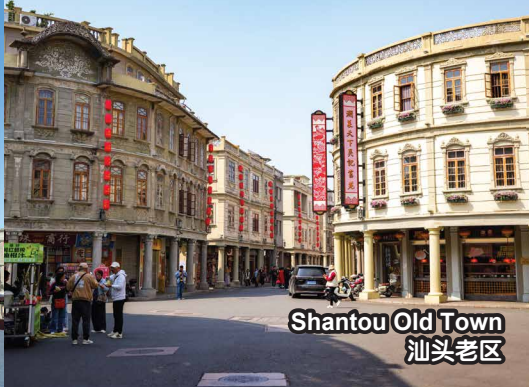
Shantou Old Town 汕头老区