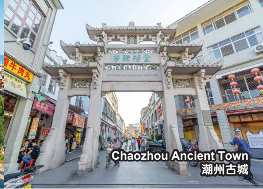
Chaozhou Ancient Town 潮州古城