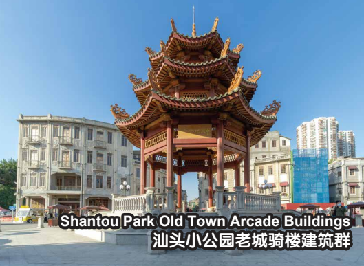
Shantou Park Old Town Arcade Buildings 汕头小公园老城骑楼建筑群