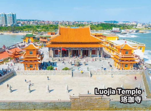
Luoja Temple 瑤珈寺