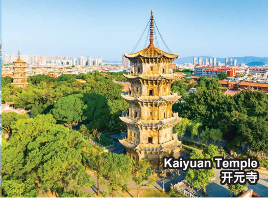
Kaiyuan Temple 开元寺