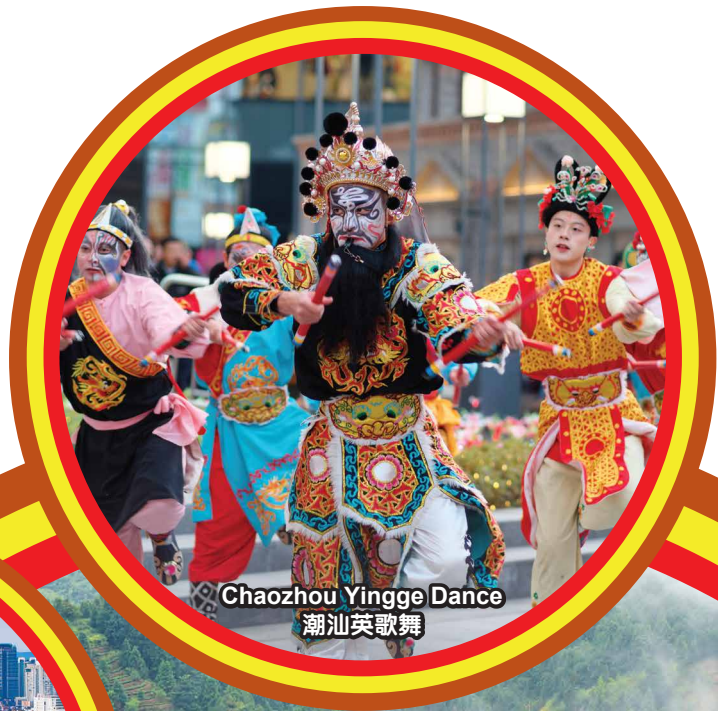
Chaozhou Yingge Dance 潮汕英歌舞