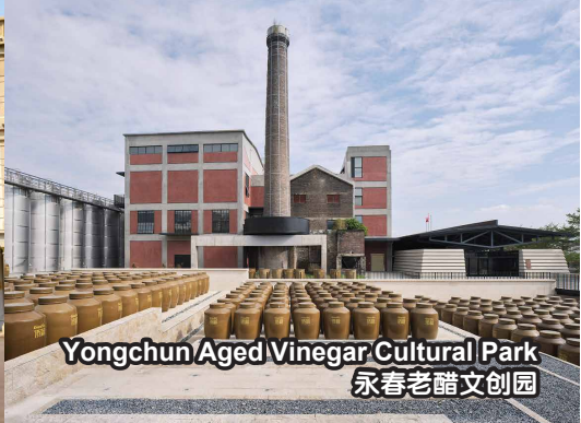
Yongchun Aged Vinegar Cultural Park 永春老醋文创园