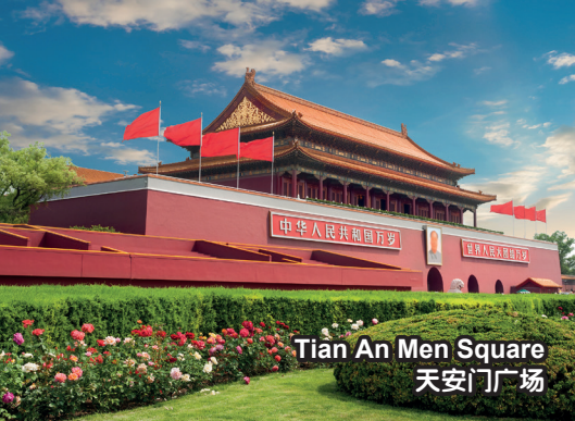
Tian An Men Square 天安门广场