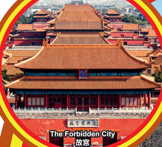
The Forbidden City 故宫