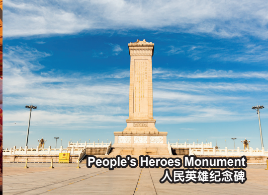
People's Heroes Monument 人民英雄纪念碑