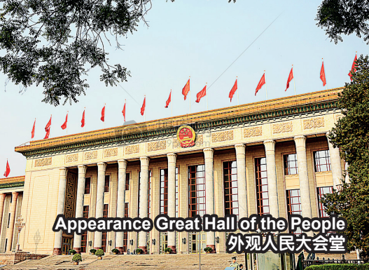
Appearance Great Hall of the People 外观人民大会堂