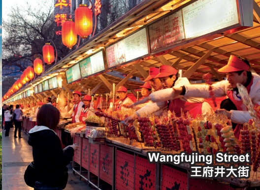
Wangfujing Street 王府井大街