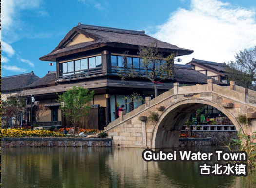
Gubei Water Town 古北水镇