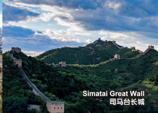
Simatai Great Wall 司马台长城