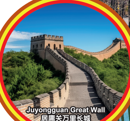
Juyongguan Great Wall 居庸关万里长城