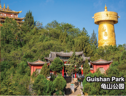
Guishan Park 龟山公园