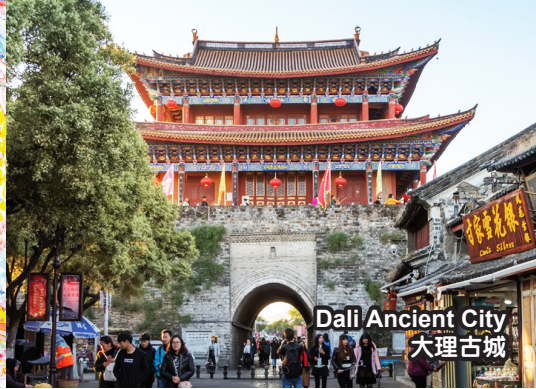
Dali Ancient City 大理古城