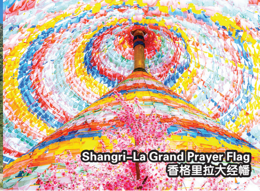
Shangri-La Grand Prayer Flag 香格里拉大经幡