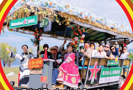
Erhai Ecological Corridor 洱海生态廊道