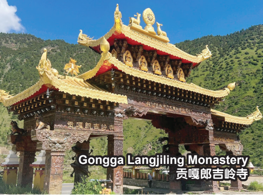
Gongga Langjiling Monastery 贡嘎郎吉岭寺