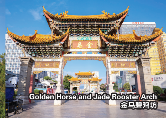
Golden Horse and Jade Rooster Arch 金马碧鸡坊