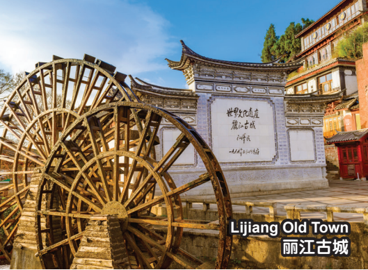
Lijiang Old Town 丽江古城