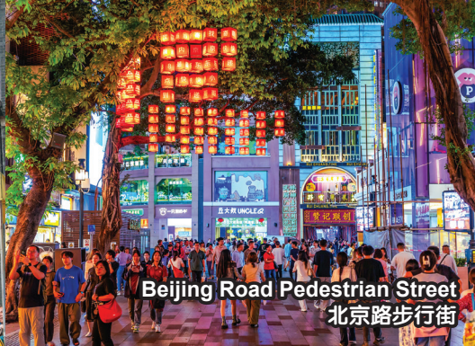
Beijing Road Pedestrian Street 北京路步行街