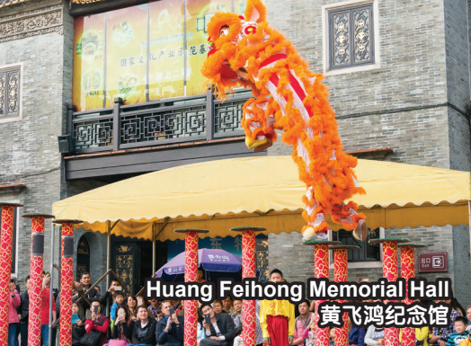
Huang Feihong Memorial Hall 黄飞鸿纪念馆