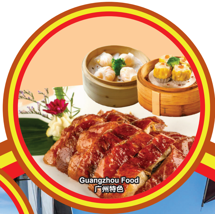
Guangzhou Food 广州特色