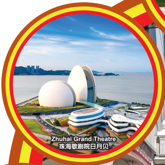
Zhuhai Grand Theatre 珠海歌剧院日月贝