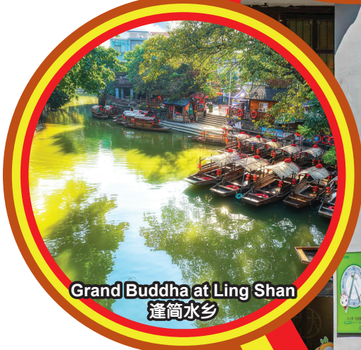
Grand Buddha at Ling Shan 逢简水乡