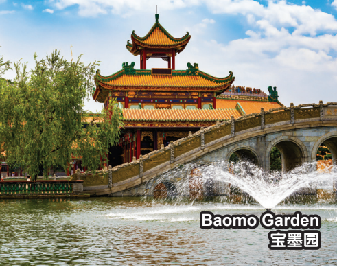
Baomo Garden 宝墨园