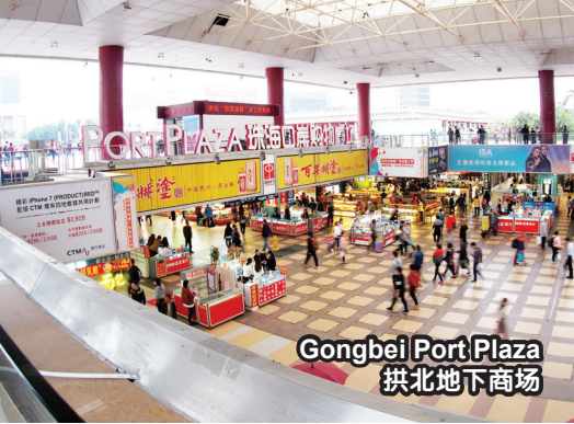
Gongbei Port Plaza 拱北地下商场