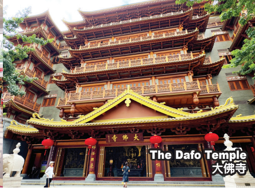
The Dafo Temple 大佛寺