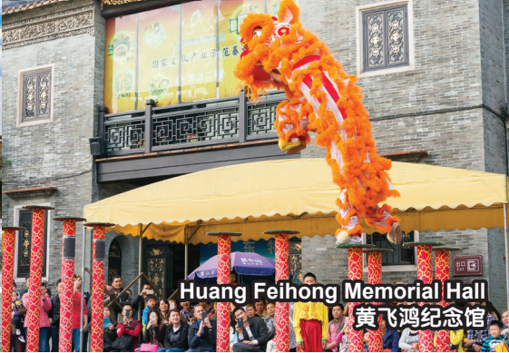
Huang Feihong Memorial Hall 黄飞鸿纪念馆