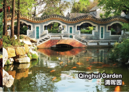
Qinghui Garden 清晖园