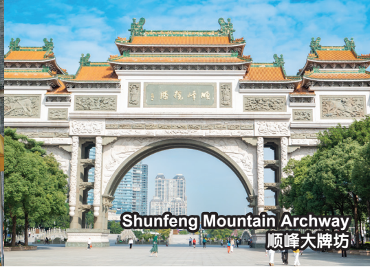
Shunfeng Mountain Archway 顺峰大牌坊