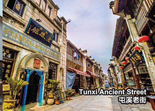
Tunxi Ancient Street 屯溪老街