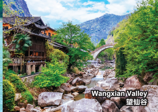
Wangxian Valley 望仙谷