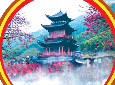
Gexian Village Resort 葛仙村