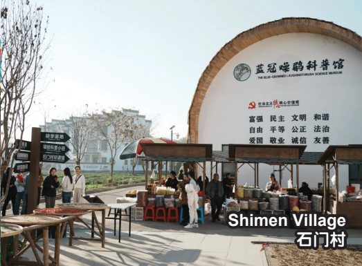
Shimen Village 石门村