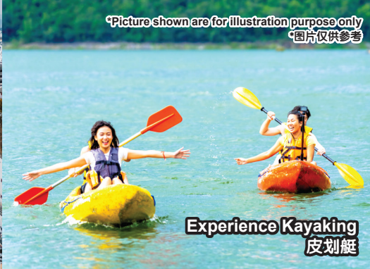
Experience Kayaking 皮划艇