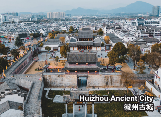
Huizhou Ancient City 徽州古城