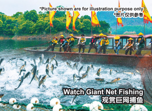
Watch Giant Net Fishing 观赏巨网捕鱼

*Picture shown are for illustration purpose only *图片仅供参考