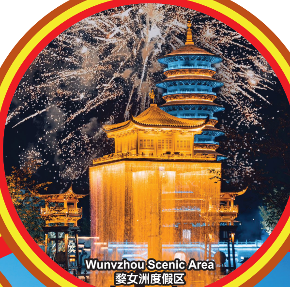
Wunvzhou Scenic Area 婺女洲度假区