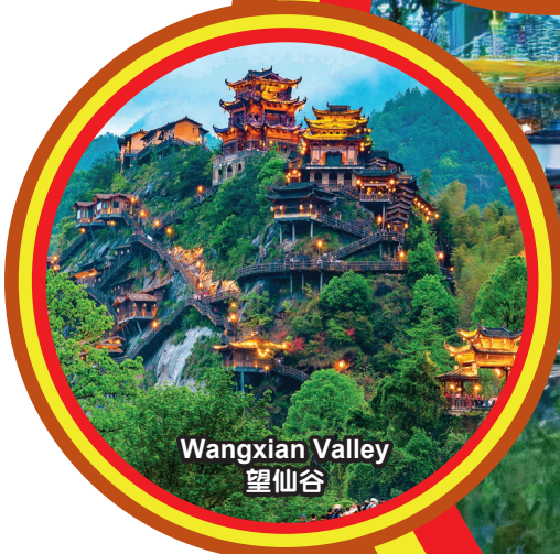
Wangxian Valley 望仙谷