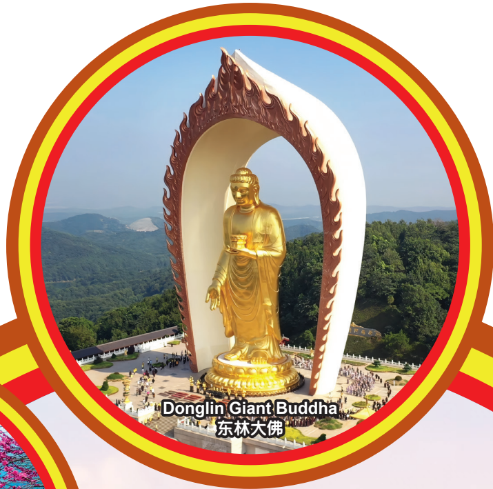
Donglin Giant Buddha 东林大佛