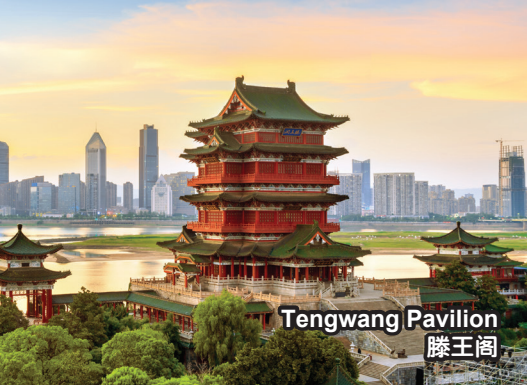
Tengwang Pavilion 滕王阁