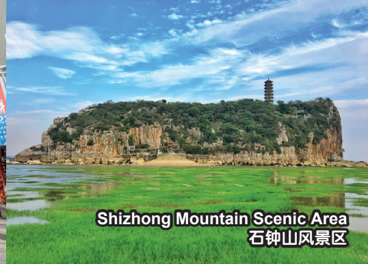
Shizhong Mountain Scenic Area 石钟山风景区