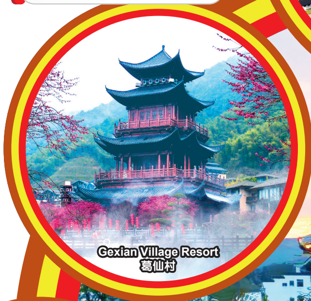
Gexian Village Resort 葛仙村