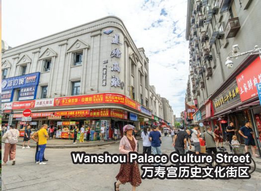
Wanshou Palace Culture Street 万寿宫历史文化街区