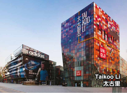
Taikoo Li 太古里