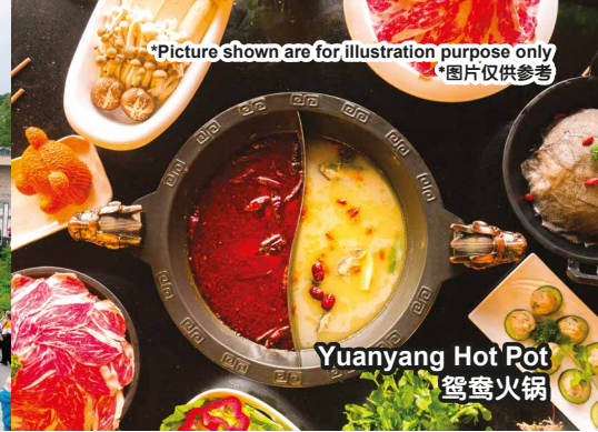
Yuanyang Hot Pot 鸳鸯火锅

*Picture shown are for illustration purpose only *图片仅供参考