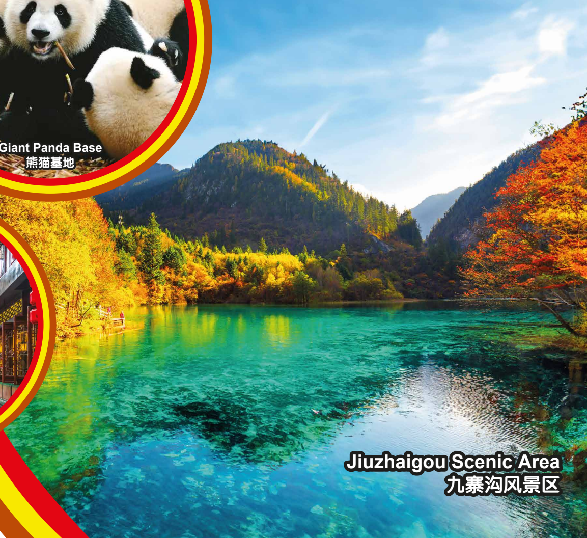
Jiuzhaigou Scenic Area 九寨沟风景区