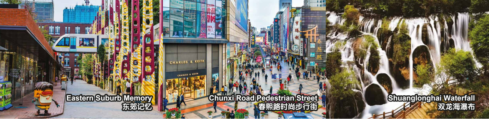
Eastern Suburb Memory 东郊记忆