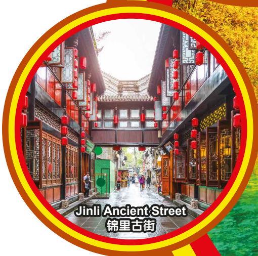
Jinli Ancient Street 锦里古街