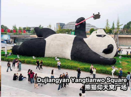
Dujiangyan Yangtianwo Square 熊猫仰天窝广场