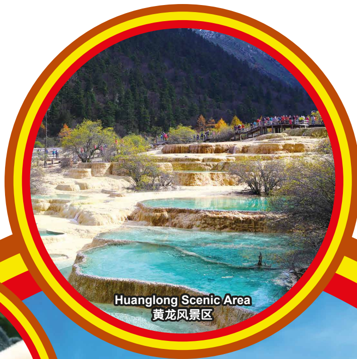
Huanglong Scenic Area 黄龙风景区