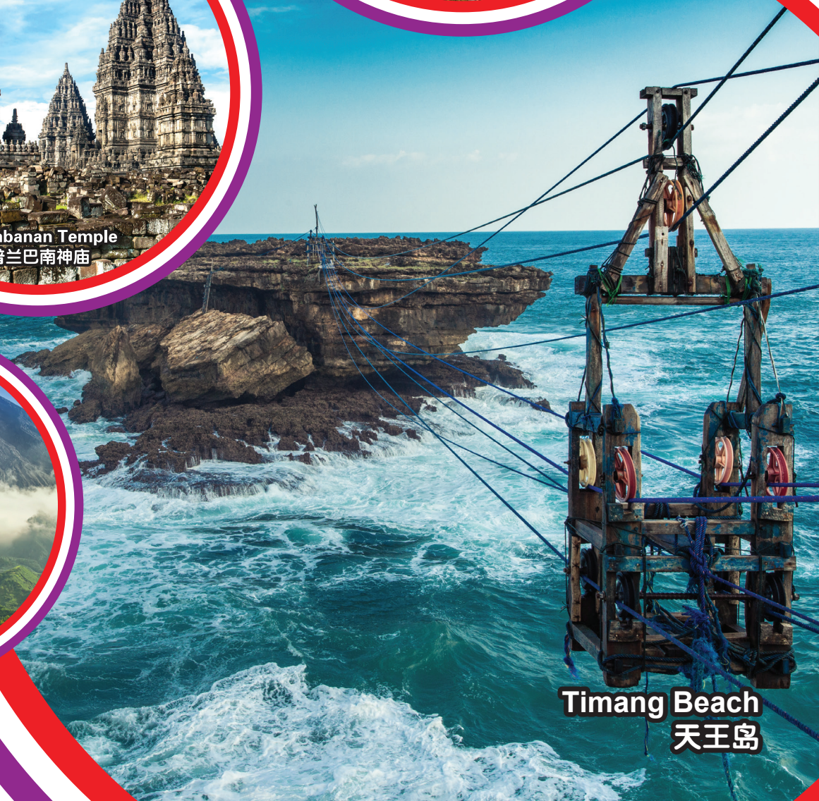
Timang Beach 天王岛

行程次序，以当地旅社安排为准。 Sequences of Itinerary are subject to local arrangement.