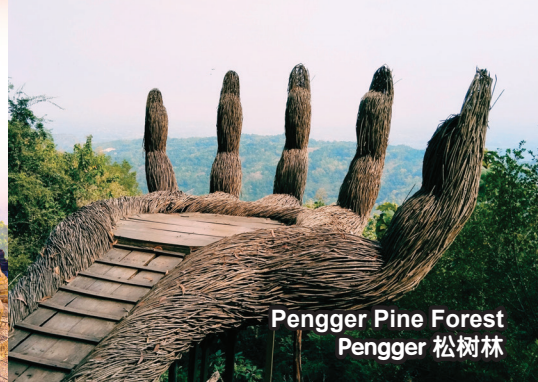
Pengger Pine Forest Pengger 松树林