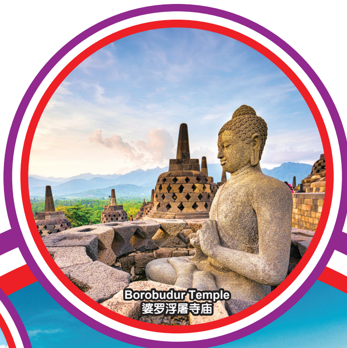
Borobudur Temple 婆罗浮屠寺庙