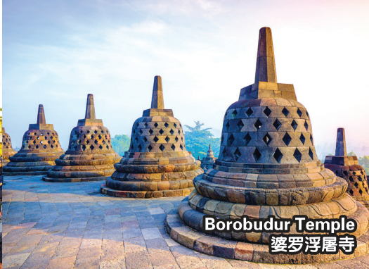
Borobudur Temple 婆罗浮屠寺