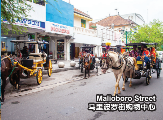
Malioboro Street 马里波罗街购物中心