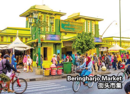
Beringharjo Market 街头市集