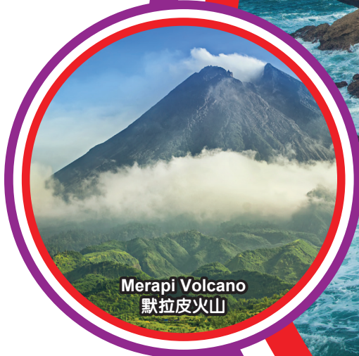
Merapi Volcano 默拉皮火山

行程次序，以当地旅社安排为准。 Sequences of Itinerary are subject to local arrangement.