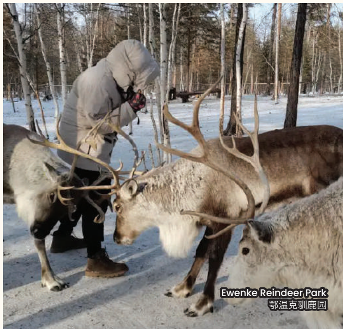
Ewenke Reindeer Park 鄂温克驯鹿园