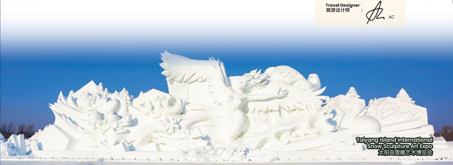
Taiyang Island International Snow Sculpture Art Expo 太阳岛雪雕艺术博览会