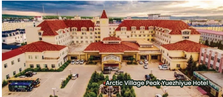
Arctic Village Peak Yuezhijue Hotel