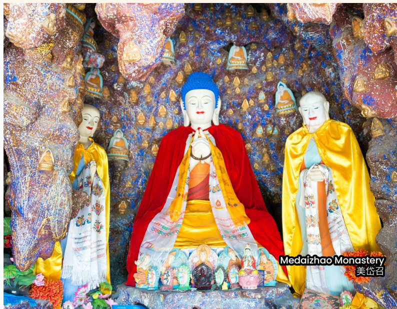
Medaizhao Monastery 美岱召