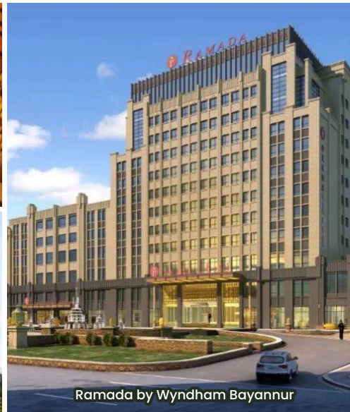
Ramada by Wyndham Bayannur