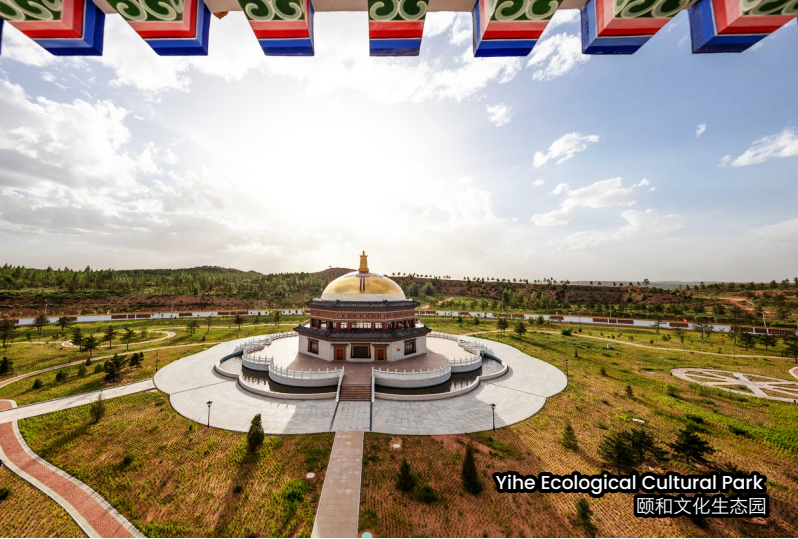
Yihe Ecological Cultural Park 颐和生态文化园