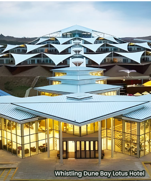
Whistling Dune Bay Lotus Hotel