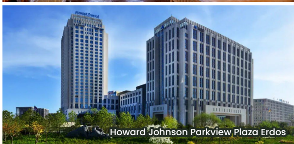
Howard Johnson Parkview Plaza Erdos