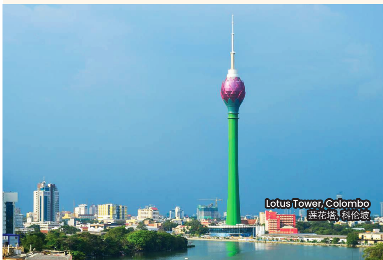
Lotus Tower, Colombo 蓮花塔, 科伦坡