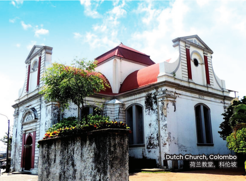
Dutch Church, Colombo 荷兰教堂。科伦坡

第01天 吉隆坡 ✈️ 科伦坡， (机上用餐//道地午餐/道地晚餐) 斯里兰卡 - 170KM - 锡吉里耶