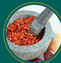
Lunu Miris 咸辣醬