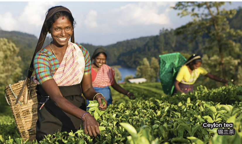
Ceylon tea 锡兰茶

佛牙寺供奉着佛牙圣物，是世界各地佛教徒最神圣的朝圣地之一。游客可以见证寺庙的日常仪式，包括点燃油灯和吟唱宗教诗。