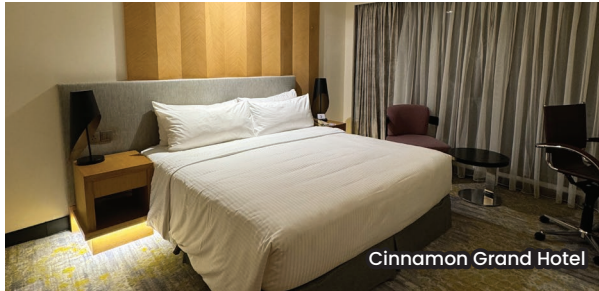
Cinnamon Grand Hotel