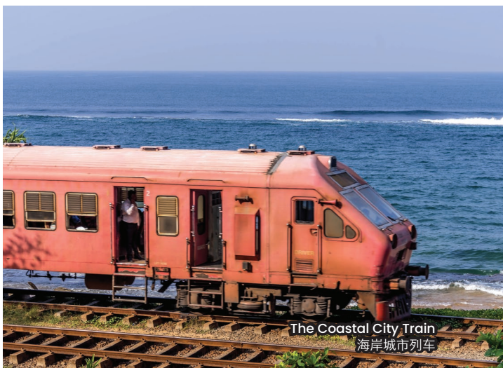
The Coastal City Train 海岸城市列车