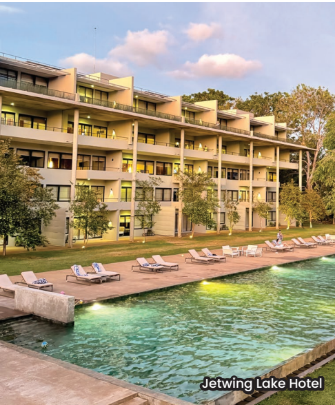
Jetwing Lake Hotel

Embark on a complete journey at 4-star & 5-star hotel, offering a quality & comfortable stay. 全程安排四+五星级酒店，让您在整个旅程中享受到有质量且舒适的住宿环境。