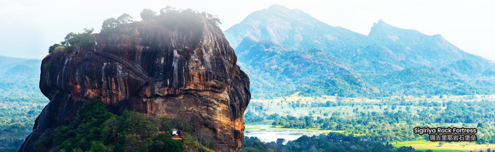
Sigiriya Rock Fortress 锡吉里耶岩石堡垒

愿您在斯里兰卡和马尔代夫，找到属于自己的那份平和与幸福。带着爱与感恩，旅途的点滴都将成为珍贵的记忆。