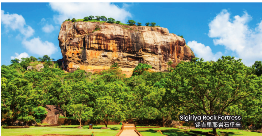
Sigiriya Rock Fortress 锡吉里耶岩石堡垒