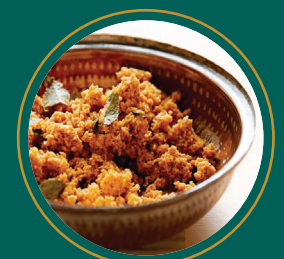
Pol Sambol 天海桑巴

Remarks/备注: All pictures in brochure are for illustration purpose only/行程上的图片仅供参考