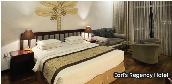
Earl's Regency Hotel