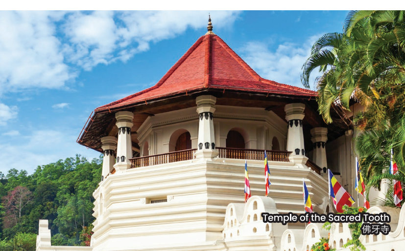
Temple of the Sacred Tooth 佛牙寺