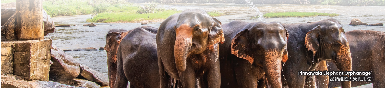
Pinnawala Elephant Orphanage 品纳维拉大象孤儿院

该孤儿院于1975年由斯里兰卡野生动物保护局建立，旨在照顾和保护在野外失去母亲或受伤的幼象，也是世界上首家专门收养受伤、迷路或失去母亲的野生亚洲象的机构。