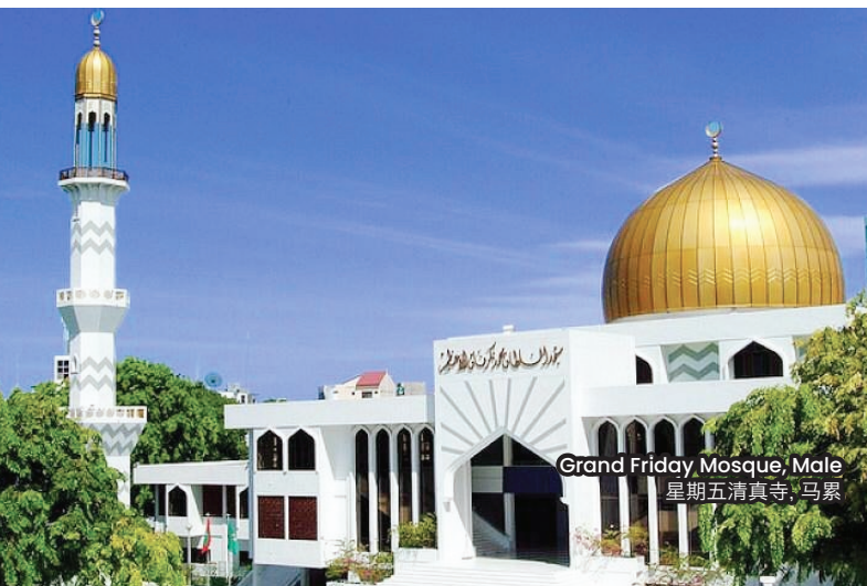
Grand Friday Mosque, Male 星期五清真寺。马累