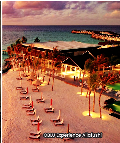
OBLU Experience Ailafushi