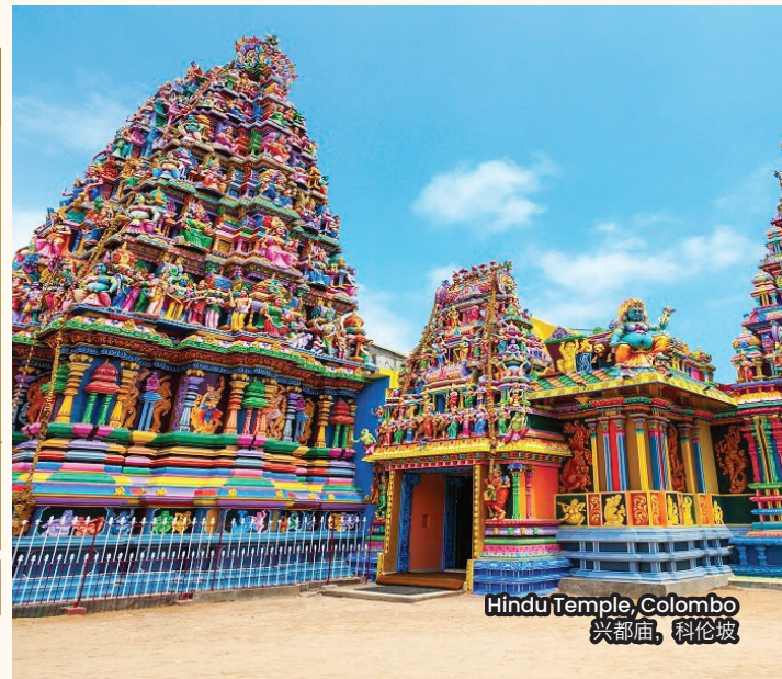
Hindu Temple, Colombo 兴都庙，科伦坡

Total Stay: Sri Lanka - 4 nights, Maldives - 3 nights