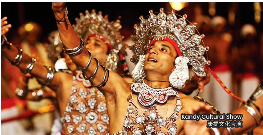
Kandy Cultural Show 康提文化表演