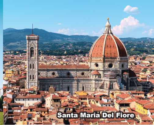
Santa Maria Del Fiore