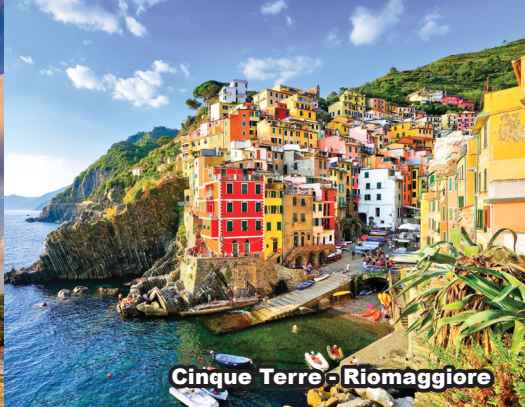
Cinque Terre - Riomaggiore