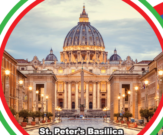
St. Peter's Basilica