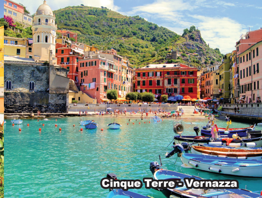
Cinque Terre - Vernazza