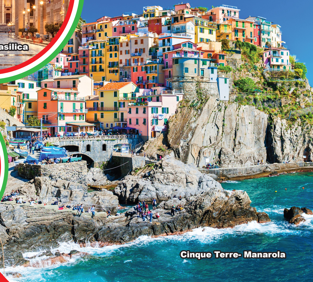
Cinque Terre- Manarola