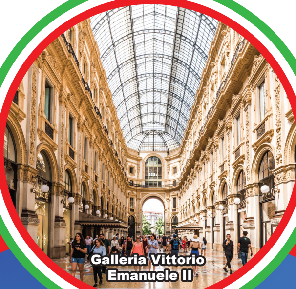
Galleria Vittorio Emanuele II