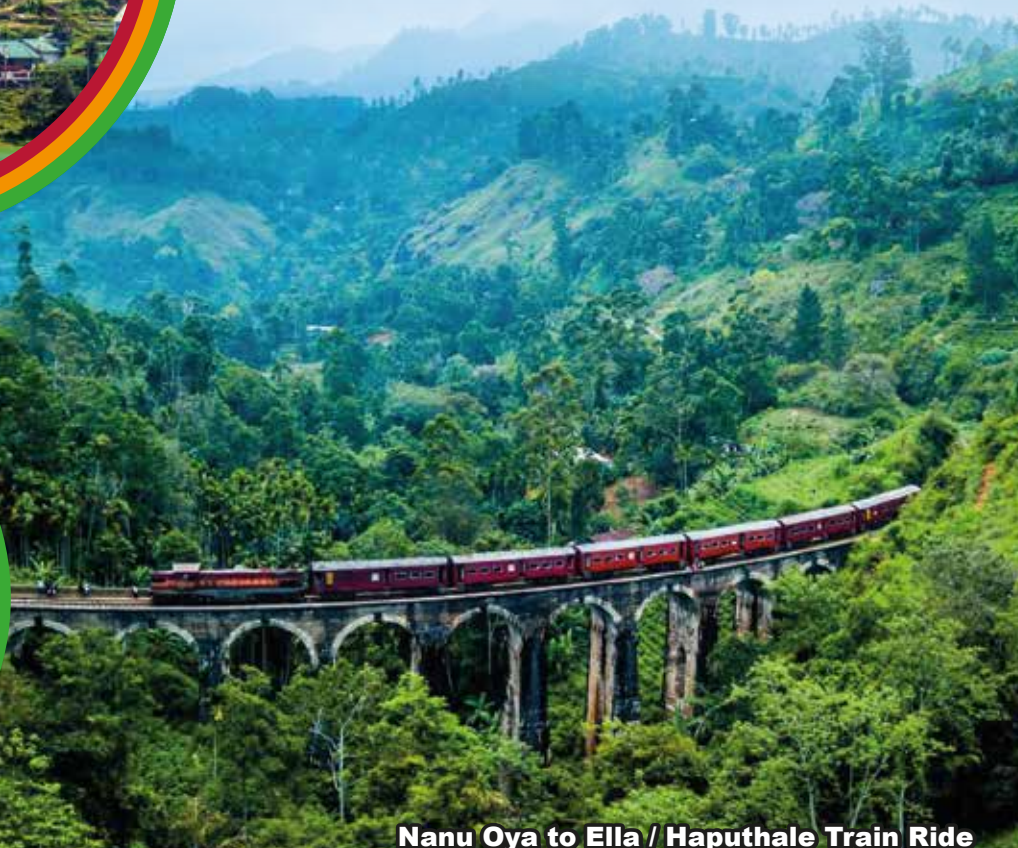
Nanu Oya to Ella / Haputhale Train Ride