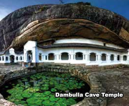
Dambulla Cave Temple