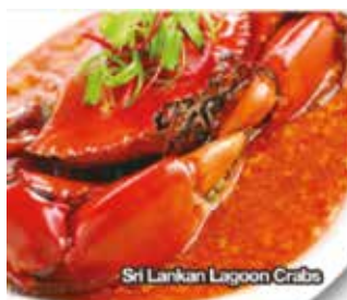
Sri Lankan Lagoon Crabs

Disclaimer: Due to Covid-19 travel restrictions, local / religious festivals, public holidays, weather condition, transport technical issue, acts of nature, Golden Destinations reserved the right to alter the sequence or change, amend or alter the itinerary if necessary, with or without prior notice.