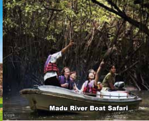
Madu River Boat Safari