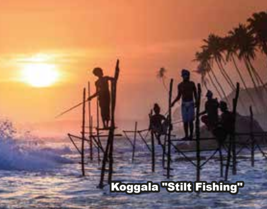
Koggala "Stilt Fishing"