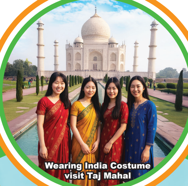
Wearing India Costume visit Taj Mahal