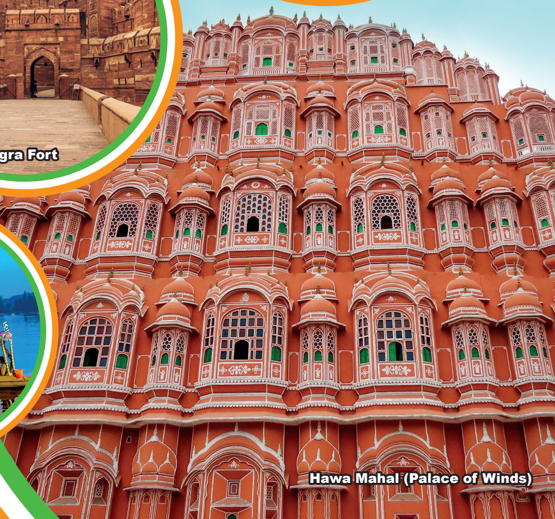
Hawa Mahal (Palace of Winds)