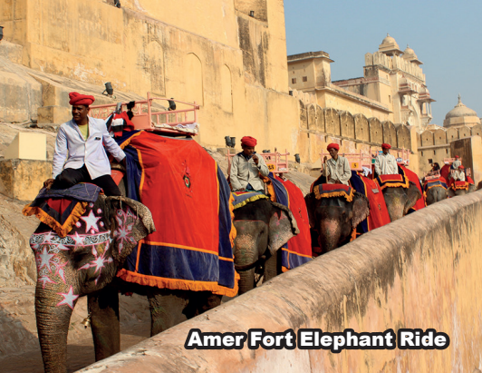
Amer Fort Elephant Ride