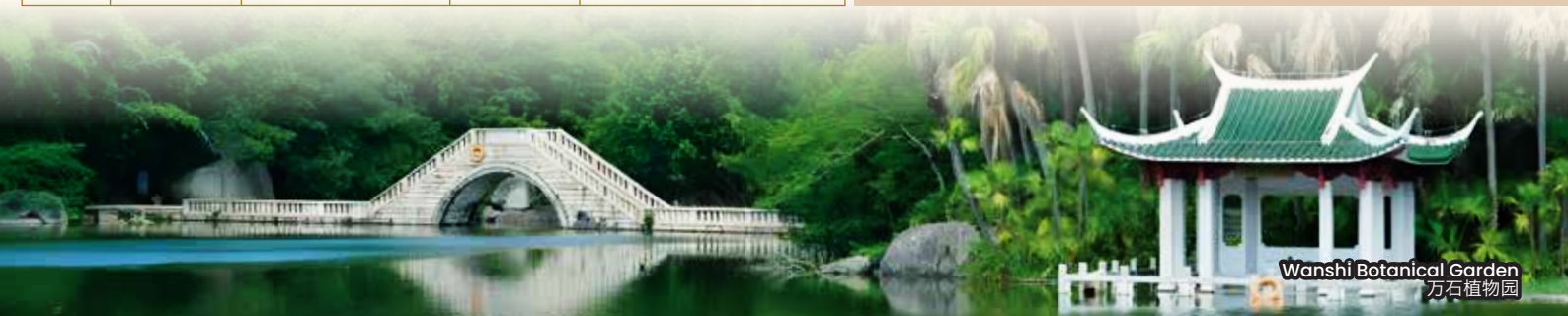
Wanshi Botanical Garden 万石植物园