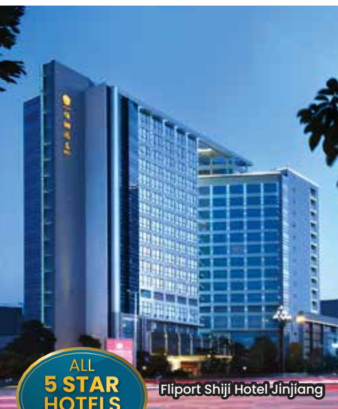
Fliport Shiji Hotel Jinjiang