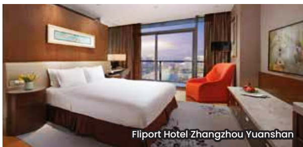
Fliport Hotel Zhangzhou Yuanshan