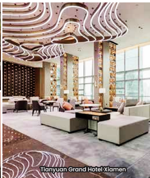
Tianyuan Grand Hotel Xiamen