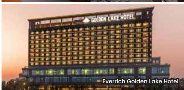
Everrich Golden Lake Hotel