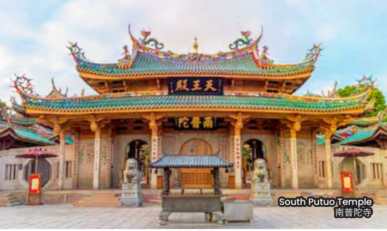
South Putuo Temple 南普陀寺