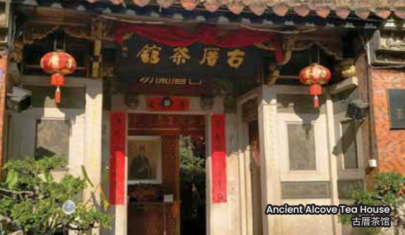
Ancient Alcove Tea House 古厝茶馆