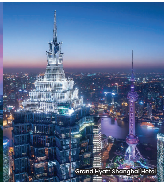
Grand Hyatt Shanghai Hotel