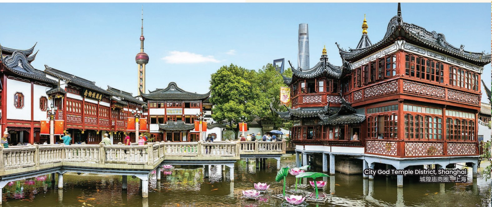
City God Temple District, Shanghai 城隍庙商圈, 上海

Sequences of itinerary are subject to local arrangement. Itineraries, meals, hotels and transportation are subject to change without prior notice.