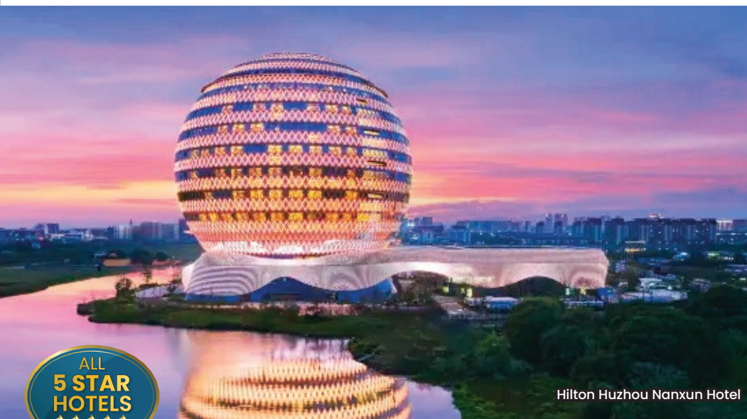
Hilton Huzhou Nanxun Hotel