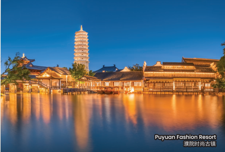
Puyuan Fashion Resort 濮院时尚古镇