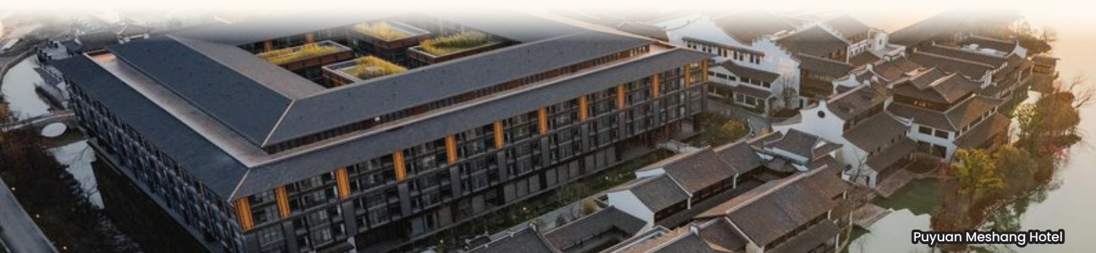
Puyuan Meshang Hotel