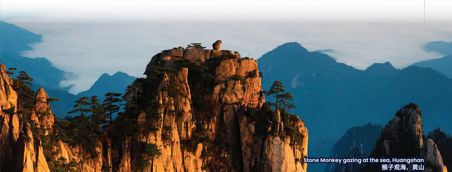
Stone Monkey gazing at the sea, Huangshan 猴子观海，黄山

黄山之行，我们特别安排了“云谷缆车上、太平缆车下”的相较轻松环线登山路线，既省体力又不走回头路，让你舒适畅游黄山精华。