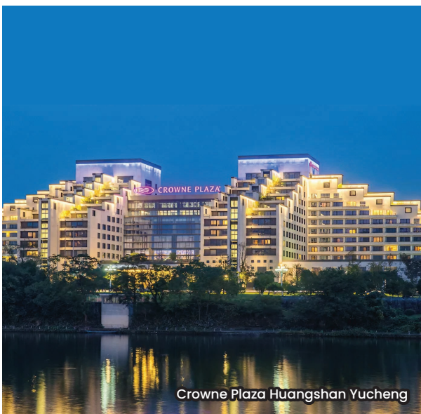
Crowne Plaza Huangshan Yucheng