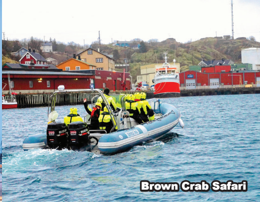
Brown Crab Safari