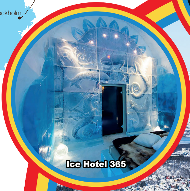
Ice Hotel 365