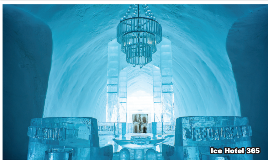
Ice Hotel 365