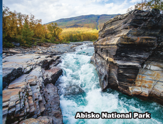
Abisko National Park