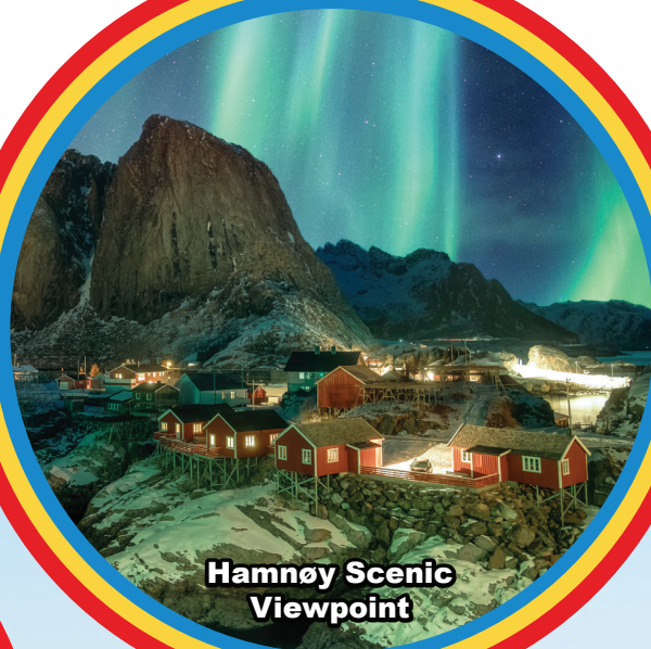
Hamnøy Scenic Viewpoint