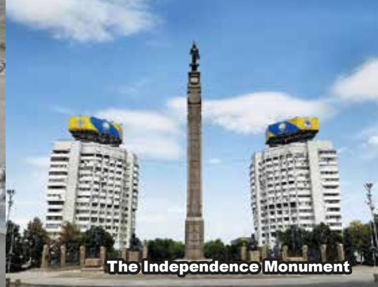
The Independence Monument