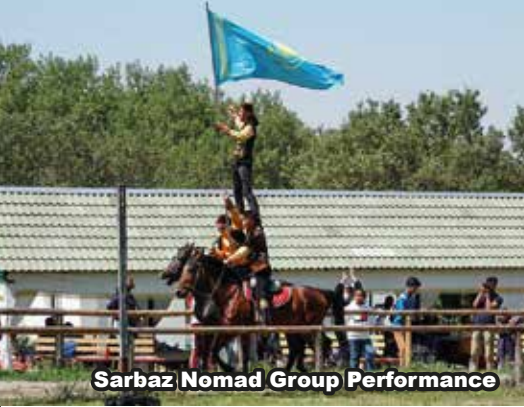
Sarbaz Nomad Group Performance