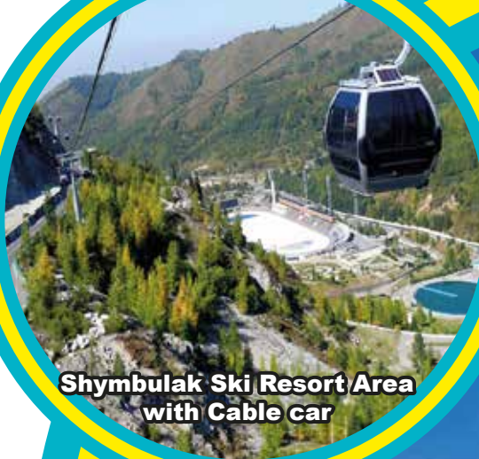
Shymbulak Ski Resort Area with Cable car