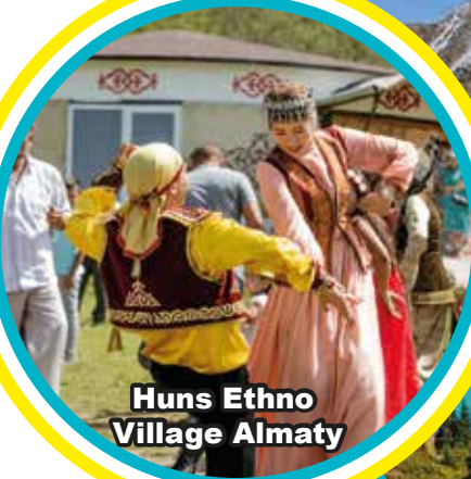
Huns Ethno Village Almaty