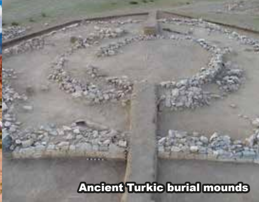
Ancient Turkic burial mounds