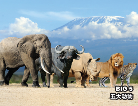
BIG 5 五大动物