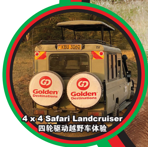
4 x 4 Safari Landcruiser 四轮驱动越野车体验