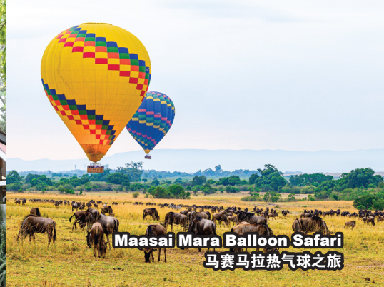
Maasai Mara Balloon Safari 马赛马拉热气球之旅