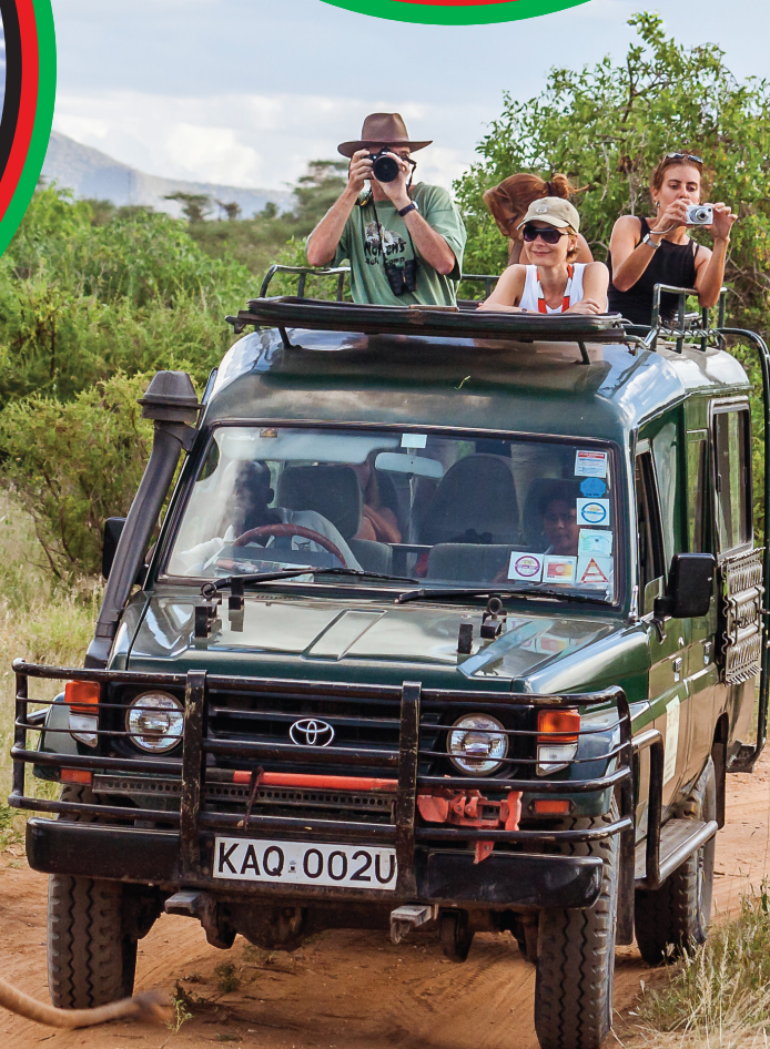
Safari Game Drive Tour 野生动物园游猎之旅