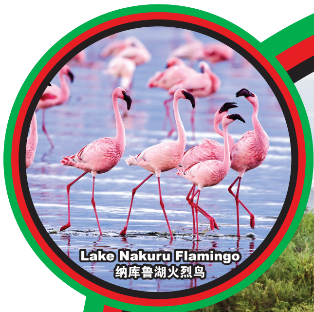
Lake Nakuru Flamingo 纳库鲁湖火烈鸟