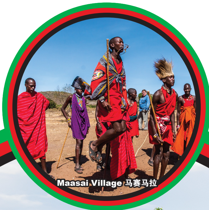
Maasai Village 马赛马拉