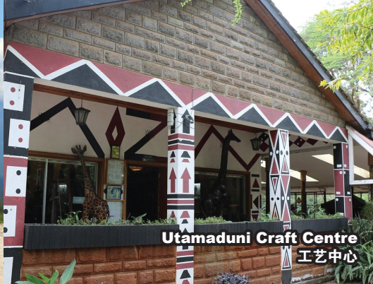
Utamaduni Craft Centre 工艺中心