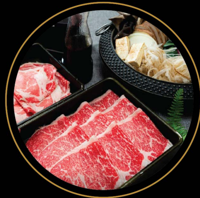
Beef & Pork Shabushabu 牛猪肉涮涮锅