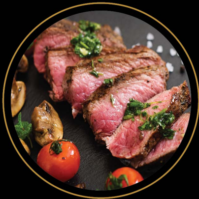
Western Set 西式套餐