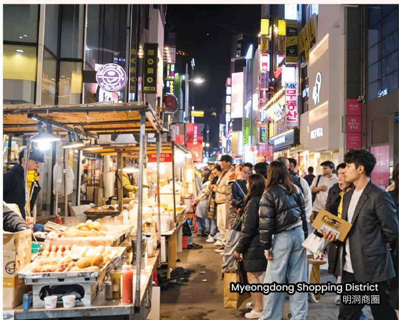
Myeongdong Shopping District 明洞商圈