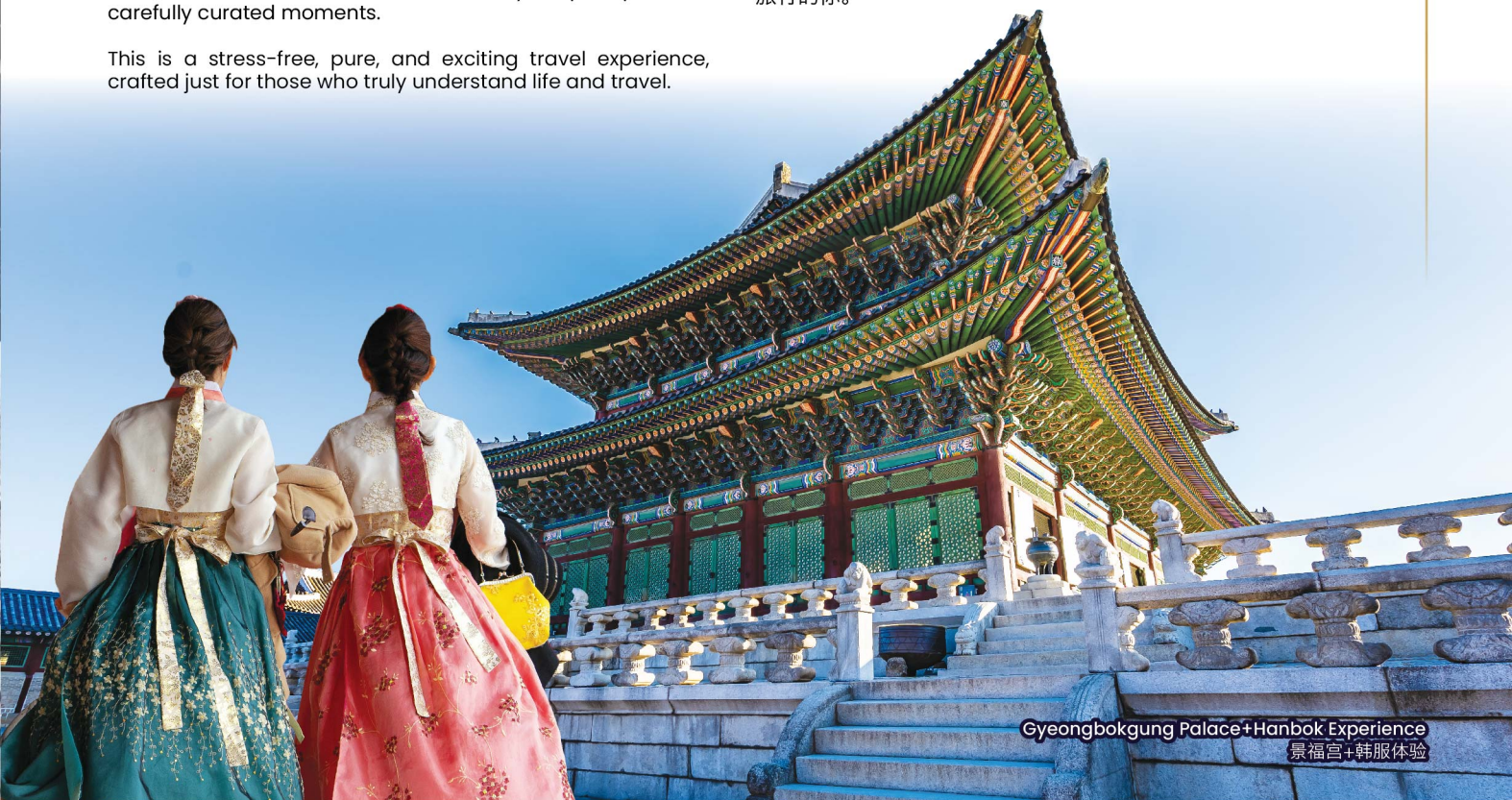
Gyeongbokgung Palace+Hanbok Experience 景福宫+韩服体验