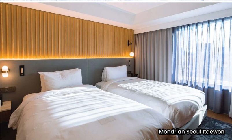
Mondrian Seoul Itaewon