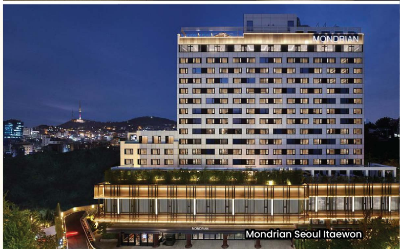
Mondrian Seoul Itaewon