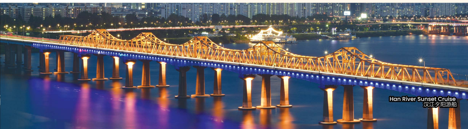
Han River Sunset Cruise 汉江夕阳游船

行程次序以当地旅行社安排为准。行程，膳食，住宿，交通等可能会因不可抗拒因素而更动，恕不另行通知。