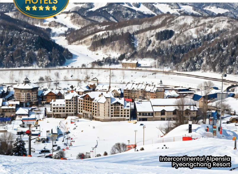
Intercontinental Alpensia Pyeongchang Resort