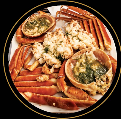
Long Leg Crab Set 长脚蟹套餐