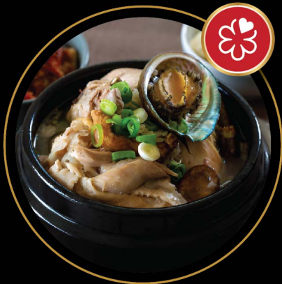
Ginseng Chicken Soup with Abalone 鲍鱼人参鸡汤