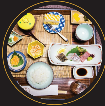
Onsen Kaiseki Ryori 温泉怀石料理