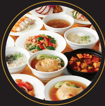
Yokohama Chinatown Buffet 横滨中华街自助餐