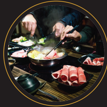
Kurobuta Hot Pot 日本黑毛猪火锅