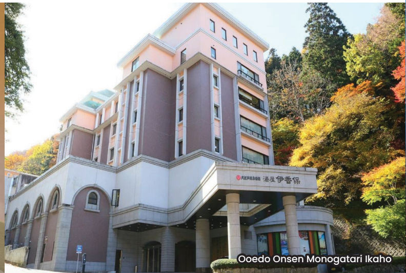
Oedo Onsen Monogatari Ikaho