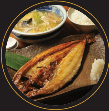
Grilled Fish Teishoku 烤鱼定食