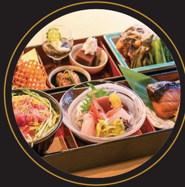
Matsuhana Course 松花御膳