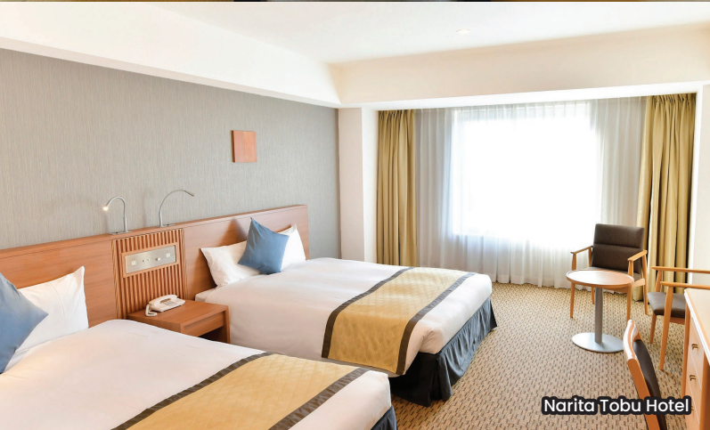
Narita Tobu Hotel