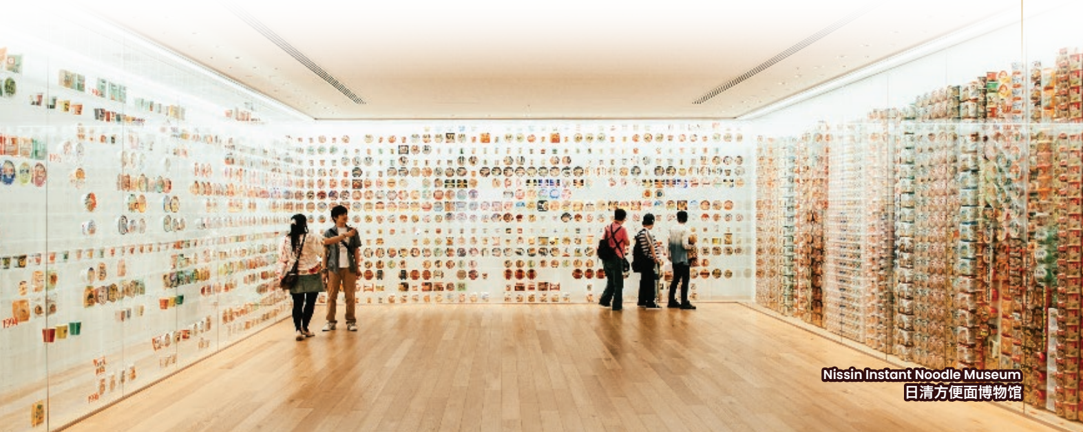
Nissin Instant Noodle Museum 日清方便面博物馆