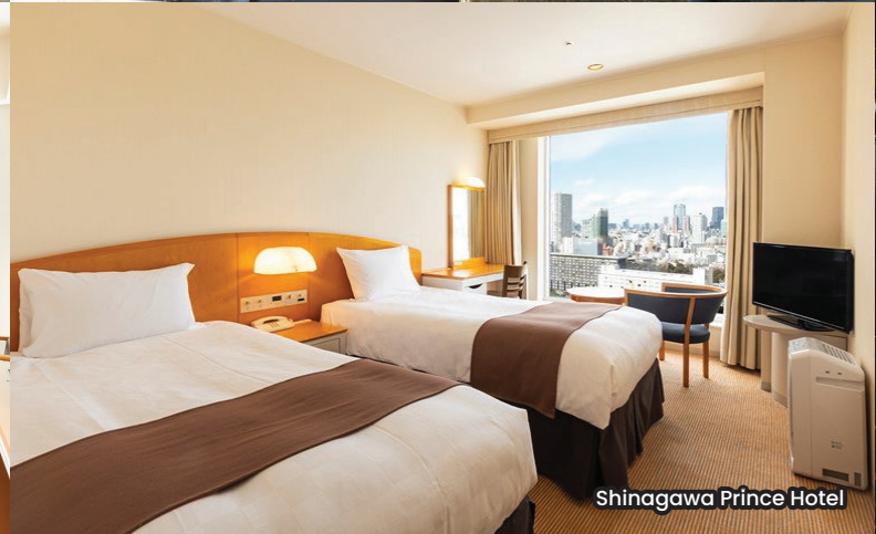
Shinagawa Prince Hotel