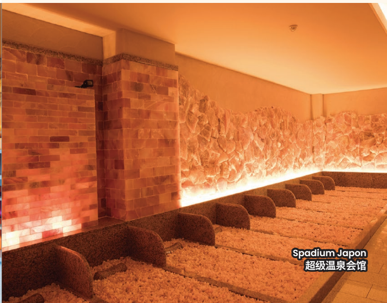
Spadium Japon 超级温泉会馆