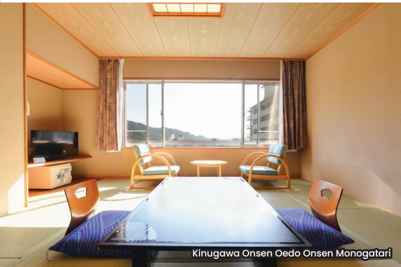
Kinugawa Onsen Oedo Onsen Monogatari