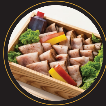
Hanagozen Bento 花御膳