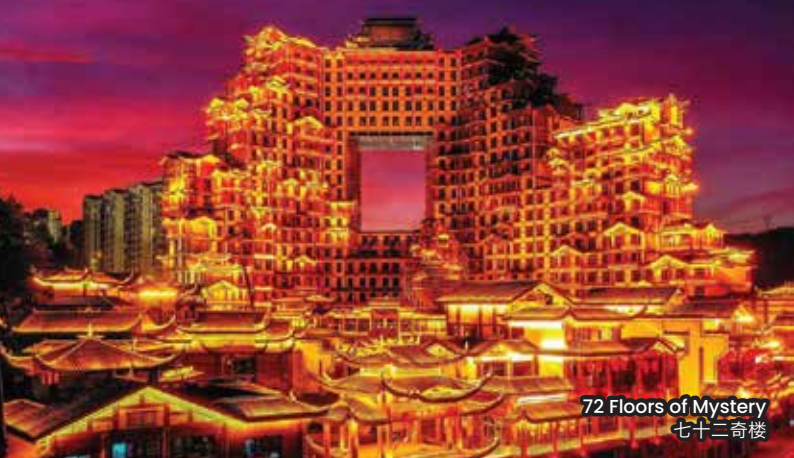
72 Floors of Mystery 七十二奇楼