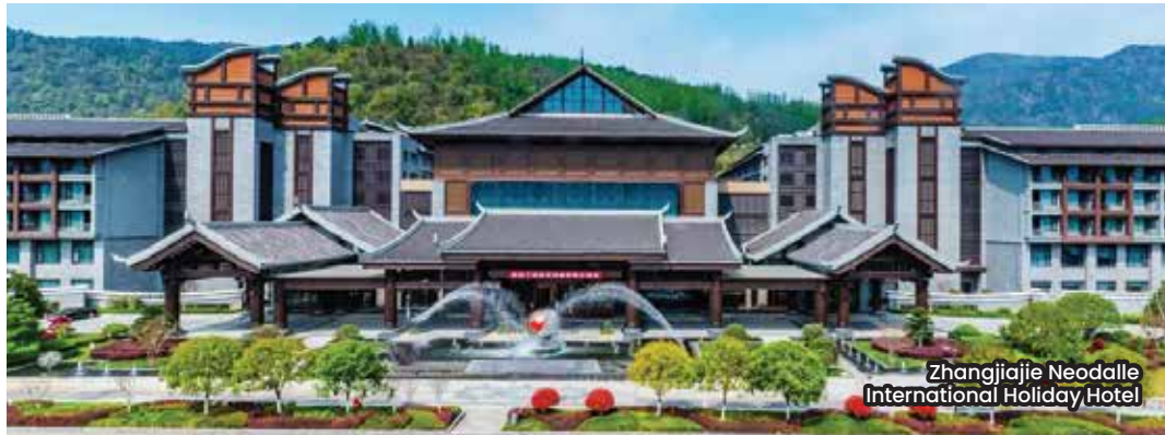
Zhangjiajie Neodalle International Holiday Hotel