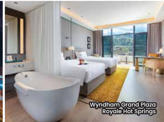
Wyndham Grand Plaza Royale Hot Springs