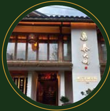
Qin Da Ma Tusi Cuisine 秦大妈土司御宴

以70年代怀旧风格与地道湘西土菜闻名，小桥流水、池塘渔市、木屋包厢让人仿佛穿越时光隧道，回到上世纪的知青岁月，感受那份质朴与人情味。