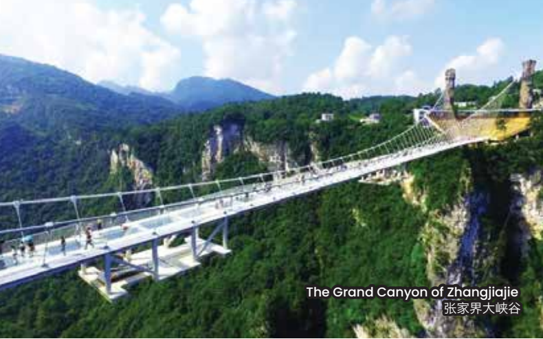
The Grand Canyon of Zhangjiajie 张家界大峡谷