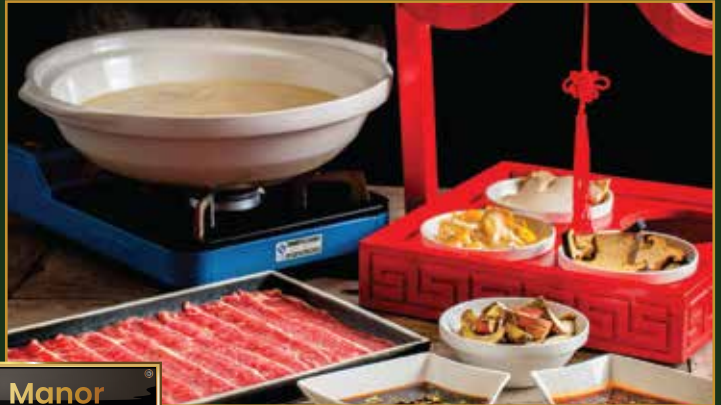
Qingxi Manor 晴溪庄园

Black Pearl Restaurant Guide in 2023 and 2024. 2023年和2024年入选黑珍珠餐厅指南一钻餐厅。