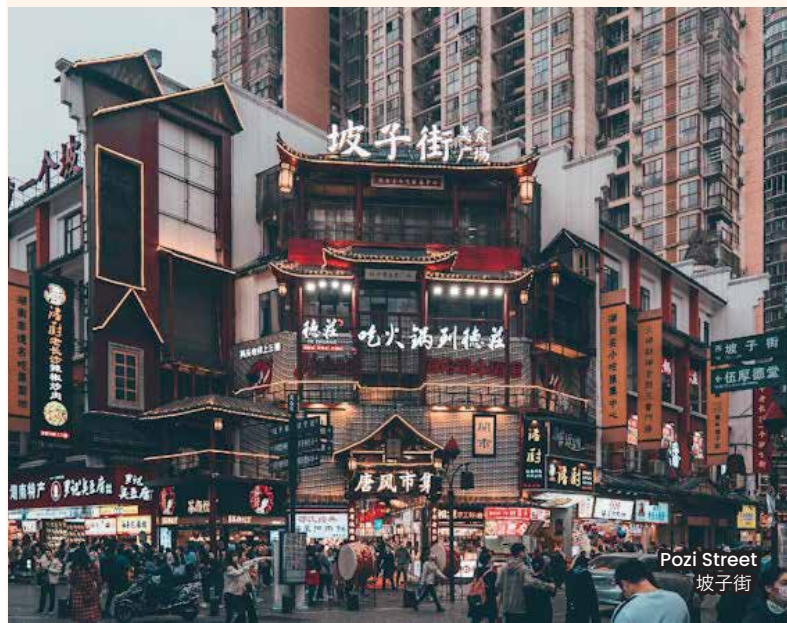
Pozi Street 坡子街

行程次序以当地旅行社安排为准。行程，膳食，住宿，交通等可能会因不可抗力因素而更动，恕不另行通知。