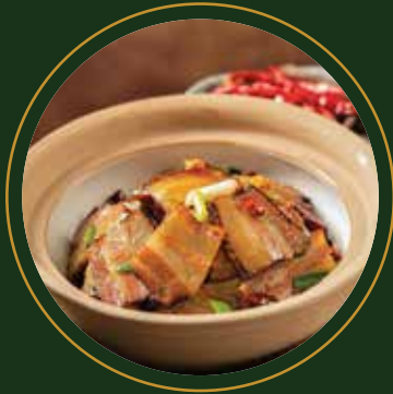
Daduizhai Fishing Village 大队老渔村

A simple feast that is pleasing to the heart, slow-cooked with skill and care to bring out the original fragrance of the food.