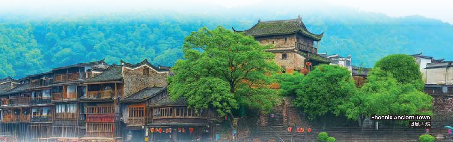
Phoenix Ancient Town 凤凰古城