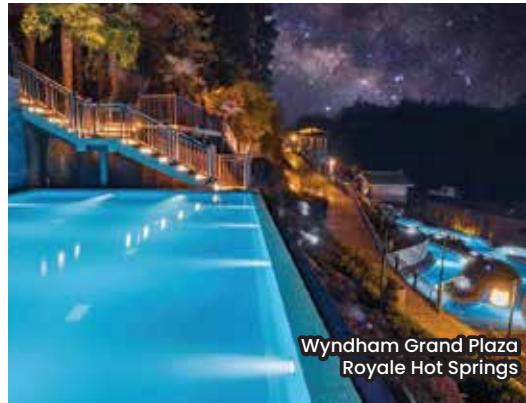
Wyndham Grand Plaza Royale Hot Springs