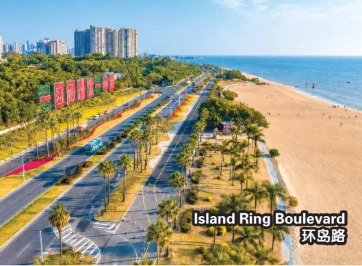
Island Ring Boulevard 环岛路