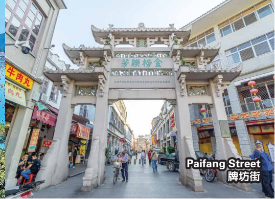
Paifang Street 牌坊街