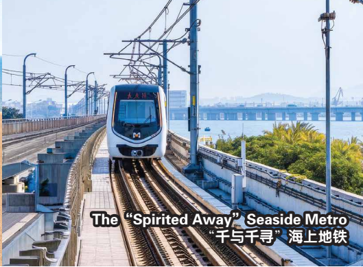
The "Spirited Away" Seaside Metro "千与千寻"海上地铁