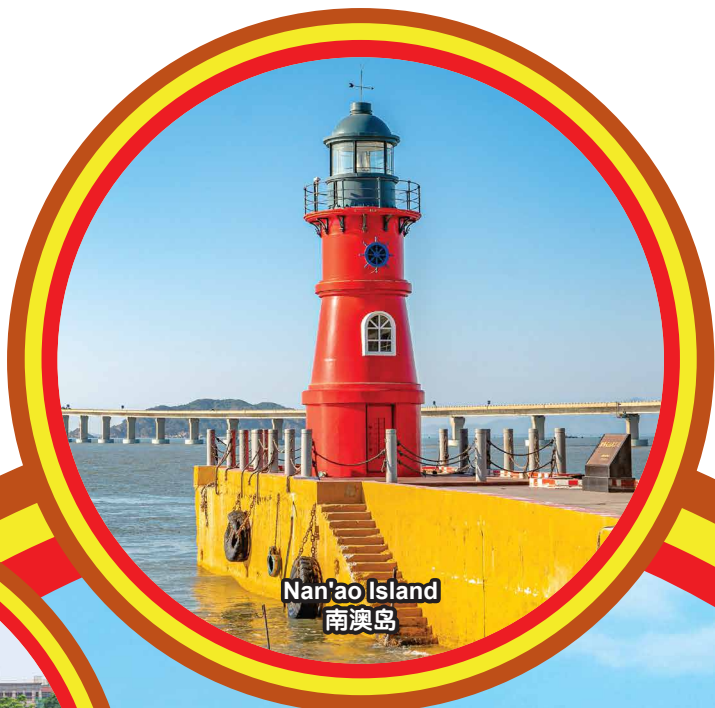
Nan'ao Island 南澳岛