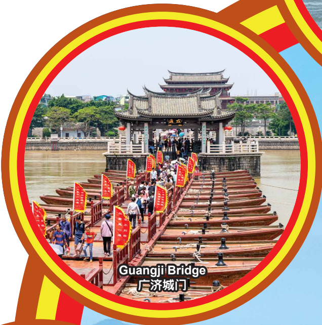
Guangji Bridge 广济城门