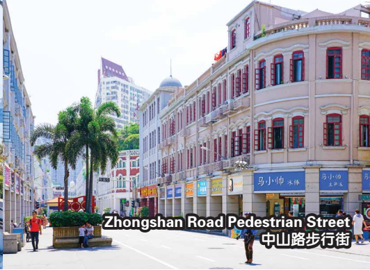
Zhongshan Road Pedestrian Street 中山路步行街