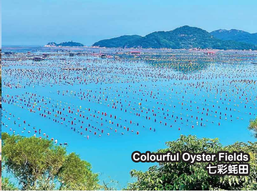
Colourful Oyster Fields 七彩蚝田