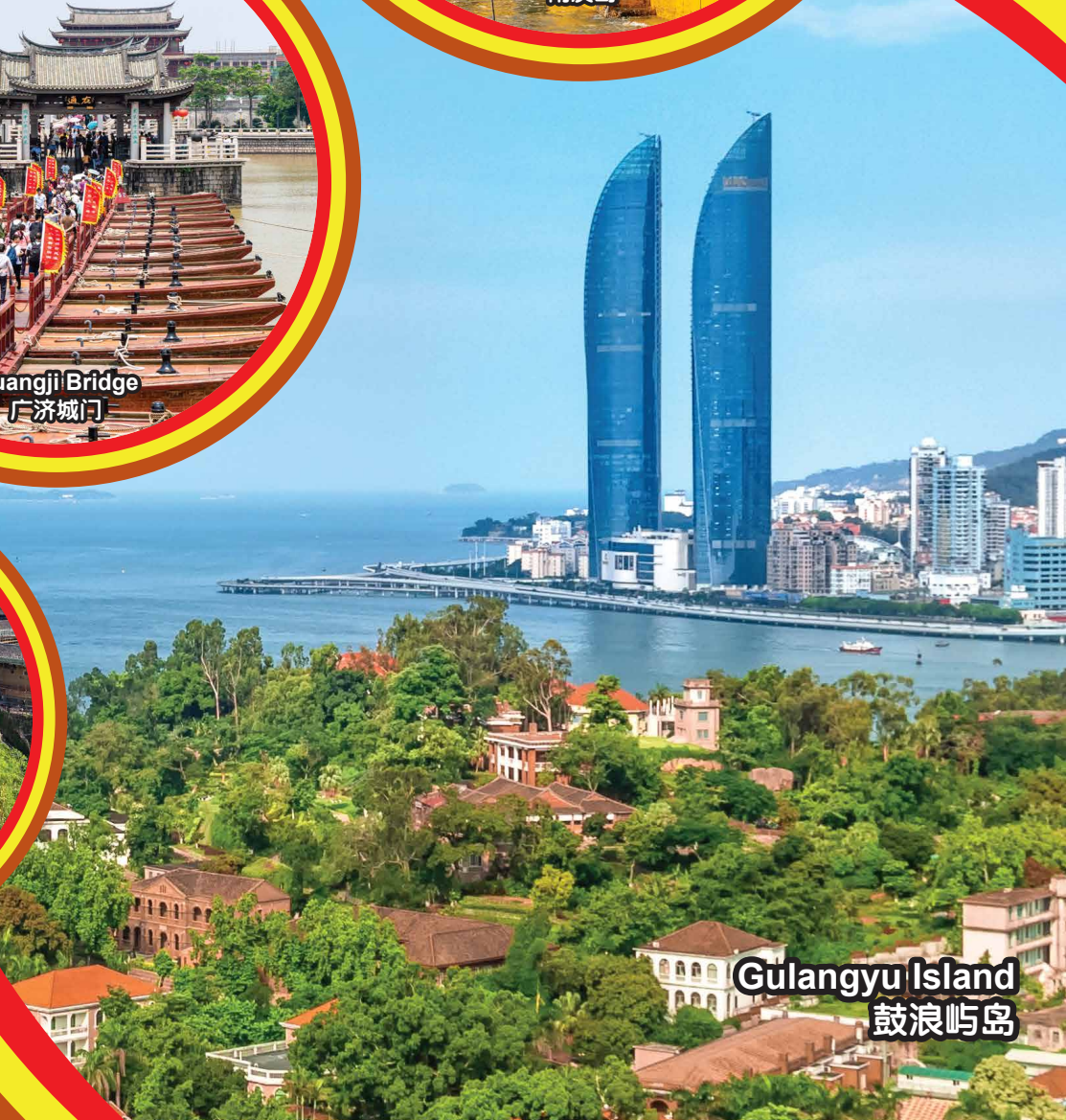
Gulangyu Island 鼓浪屿岛

行程次序，以当地旅社安排为准。 Sequences of itinerary are subject to local arrangement.