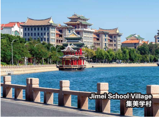
Jimei School Village 集美学校