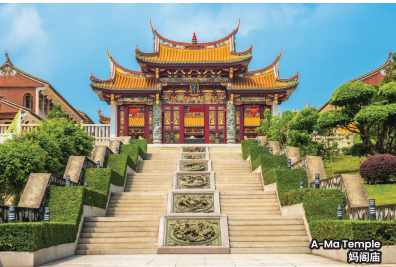
A-Ma Temple 妈阁庙

行程次序以当地旅行社安排为准。行程，膳食，住宿，交通等可能会因不可抗拒因素而更动，恕不另行通知。