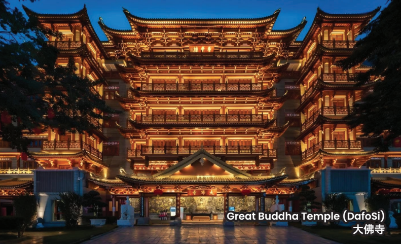
Great Buddha Temple (Dafosi) 大佛寺