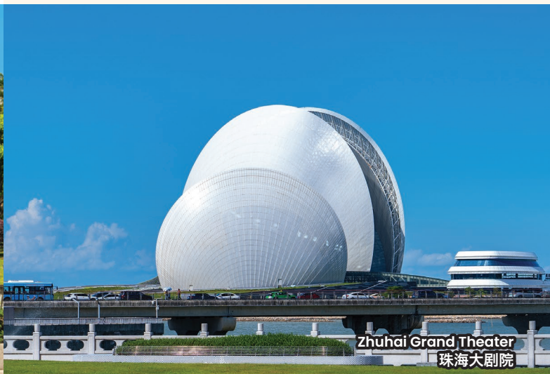
Zhuhai Grand Theater 珠海大剧院