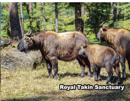
Royal Takin Sanctuary