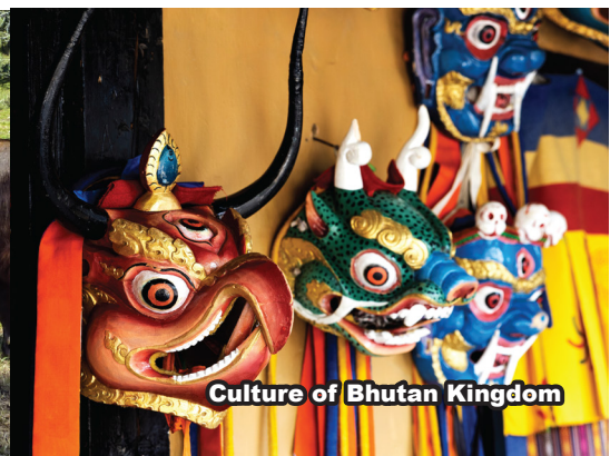
Culture of Bhutan Kingdom