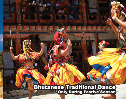
Bhutanese Traditional Dance *Only During Festive Season