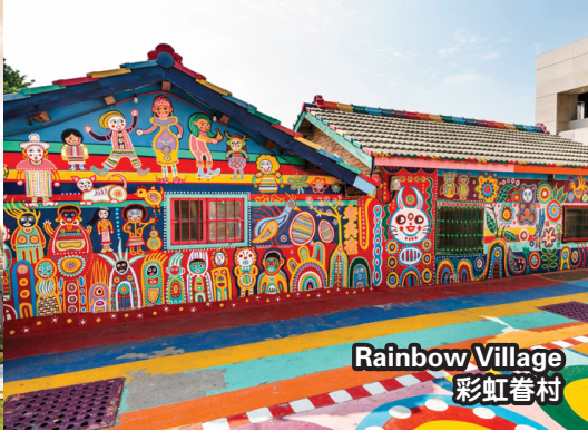
Rainbow Village 彩虹眷村