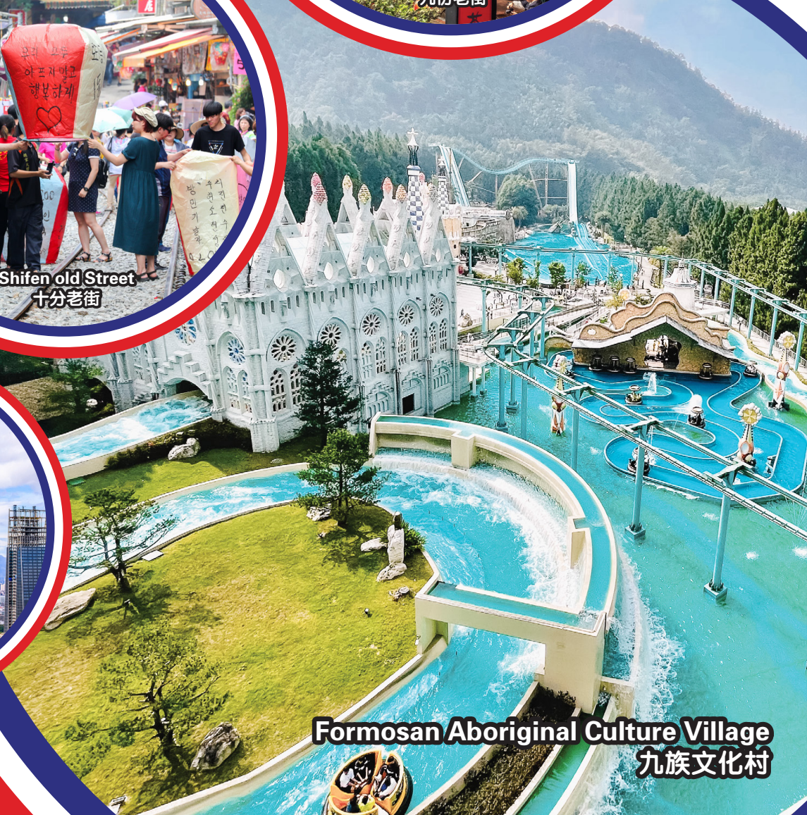
Formosan Aboriginal Culture Village 九族文化村