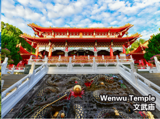
Wenwu Temple 文武庙