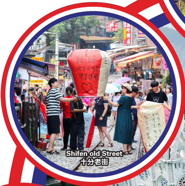
Shifen Old Street 十分老街