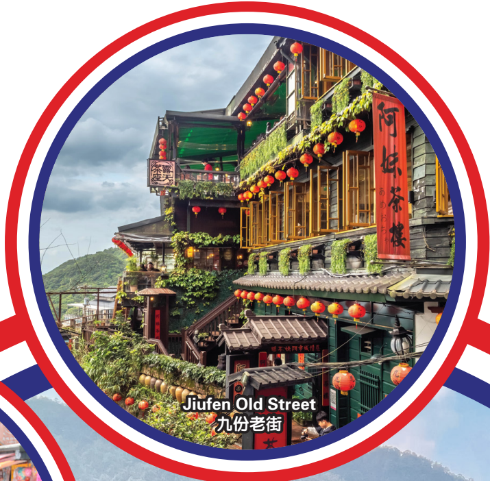
Jiufen Old Street 九份老街