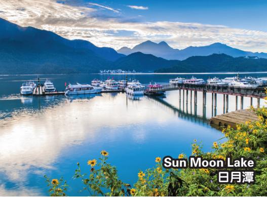
Sun Moon Lake 日月潭