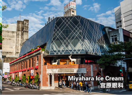
Miyahara Ice Cream 宫原眼科