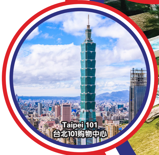
Taipei 101 台北101购物中心