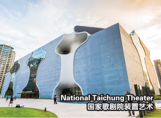
National Taichung Theater 国家歌剧院装置艺术