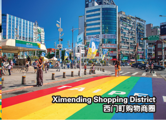
Ximending Shopping District 西门町购物商圈