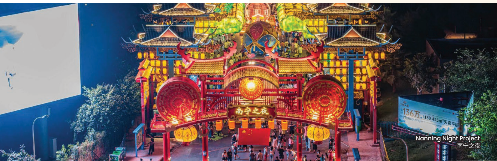
Nanning Night Project 南宁之夜

Sequences of itinerary are subject to local arrangement. Itineraries, meals, hotels and transportation are subject to change without prior notice.