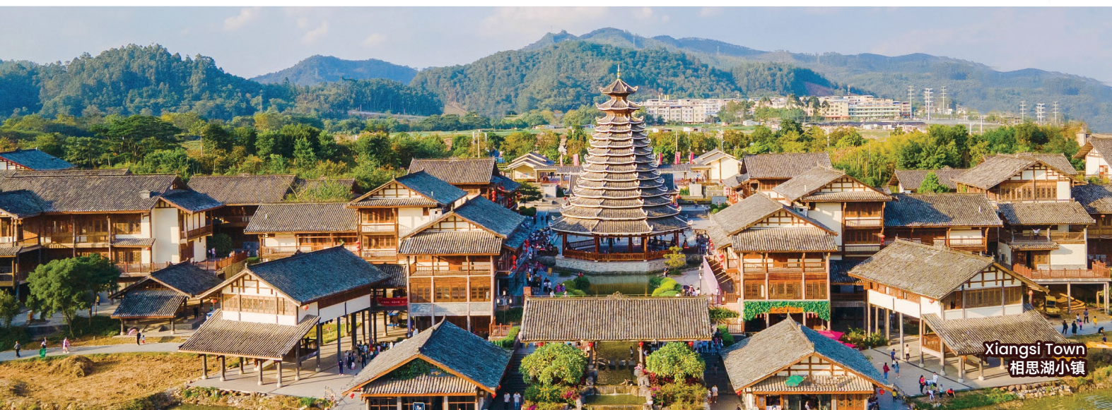
Xiangsi Town 相思湖小镇