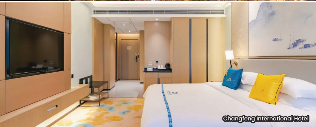
Changfeng International Hotel