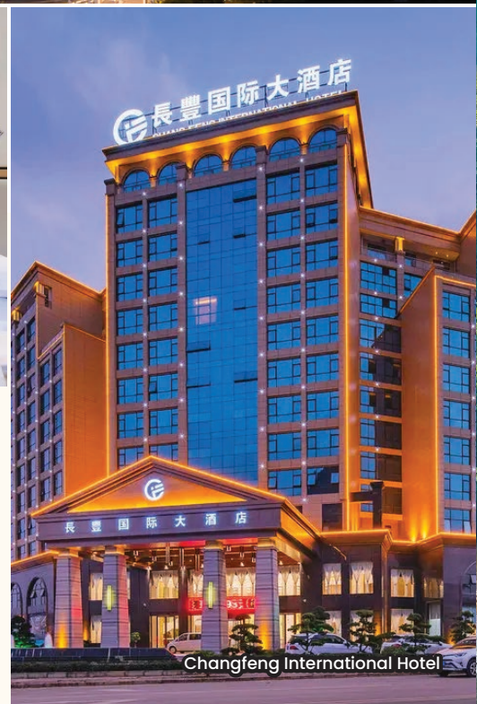
Changfeng International Hotel