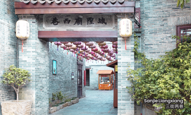
Sanjie Liangxiang 三街两巷