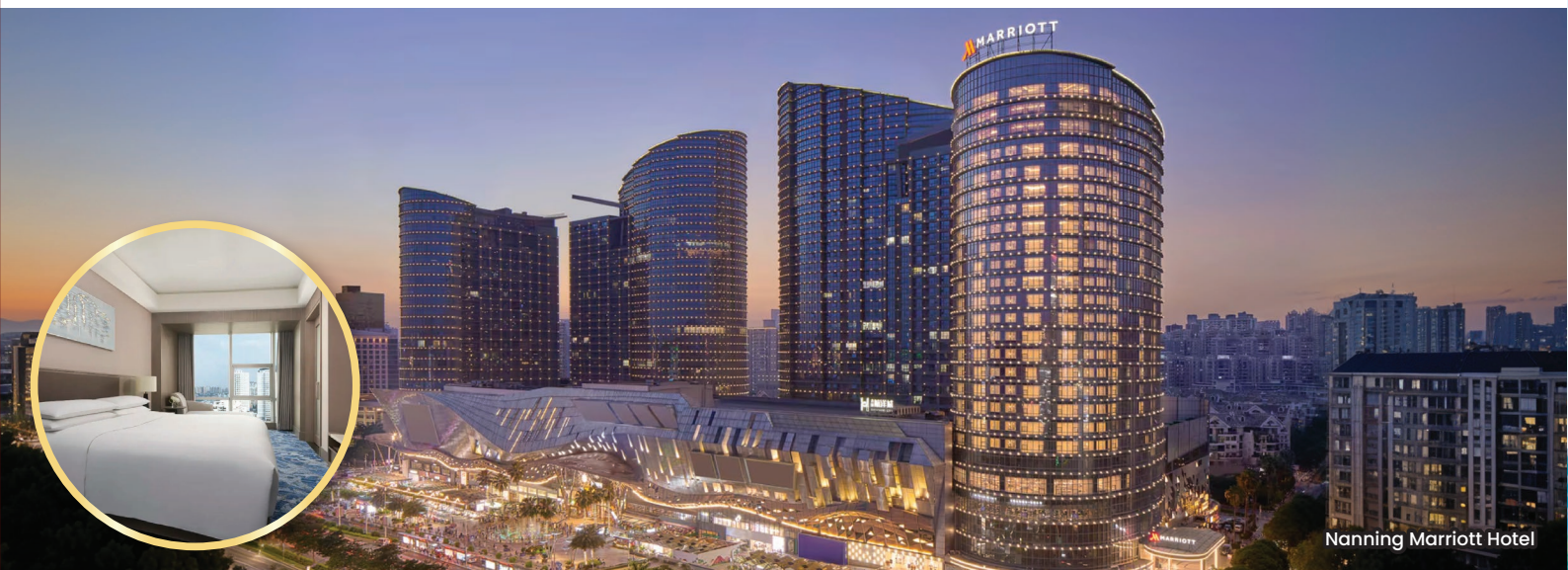
Nanning Marriott Hotel