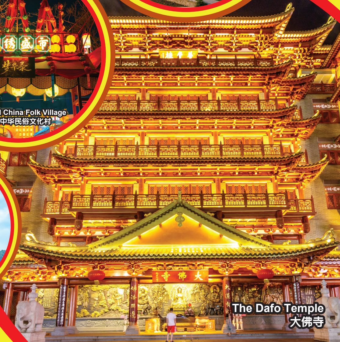
The Dafo Temple 大佛寺

行程次序，以当地旅社安排为准。 Sequences of itinerary are subject to local arrangement.