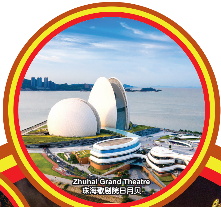
Zhuhai Grand Theatre 珠海歌剧院日月贝