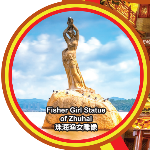
Fisher Girl Statue of Zhuhai 珠海渔女雕像