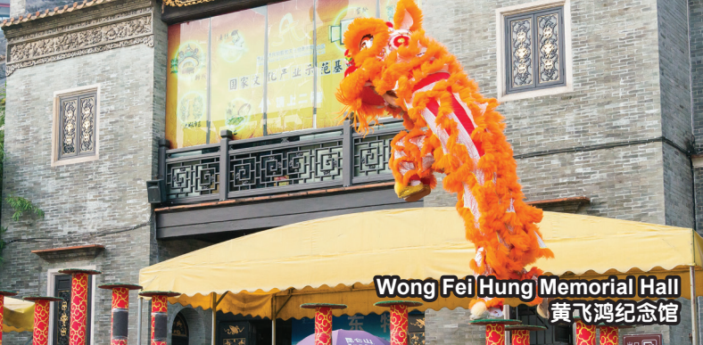
Wong Fei Hung Memorial Hall 黄飞鸿纪念馆