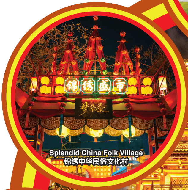
Splendid China Folk Village 锦绣中华民俗文化村