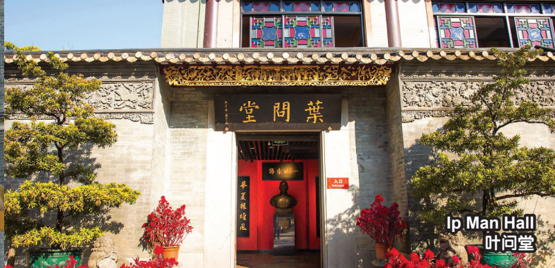
Ip Man Hall 叶问堂