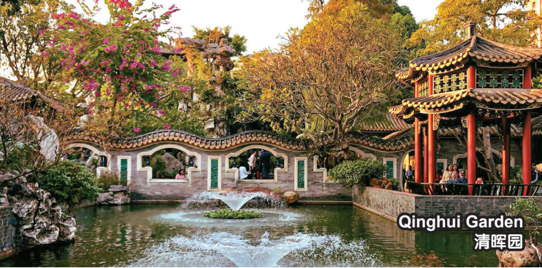
Qinghui Garden 清晖园