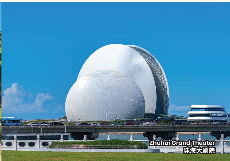
Zhuhai Grand Theater 珠海大剧院