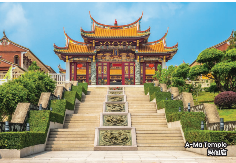
A-Ma Temple 妈阁庙

行程次序以当地旅行社安排为准。行程，膳食，住宿，交通等可能会因不可抗拒因素而更动，恕不另行通知。