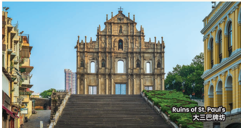
Ruins of St. Paul's 大三巴牌坊