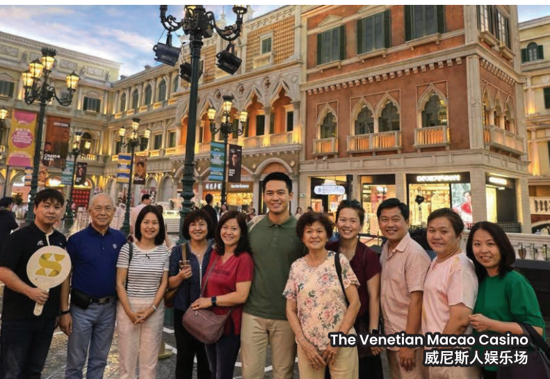
The Venetian Macao Casino 威尼斯人娱乐场

行程次序以当地旅行社安排为准。行程，膳食，住宿，交通等可能会因不可抗拒因素而更动，恕不另行通知。