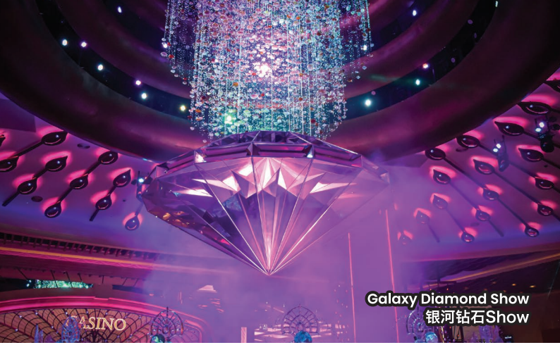
Galaxy Diamond Show 银河钻石Show