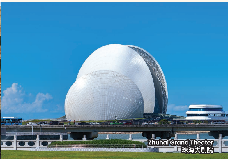
Zhuhai Grand Theater 珠海大剧院