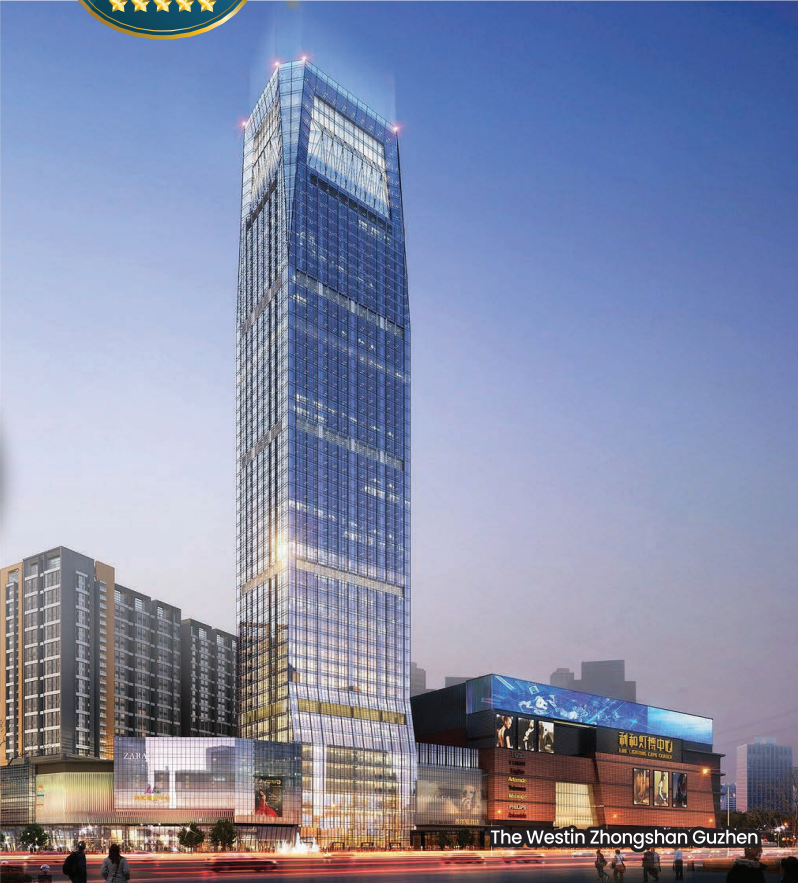
The Westin Zhongshan Guzhen