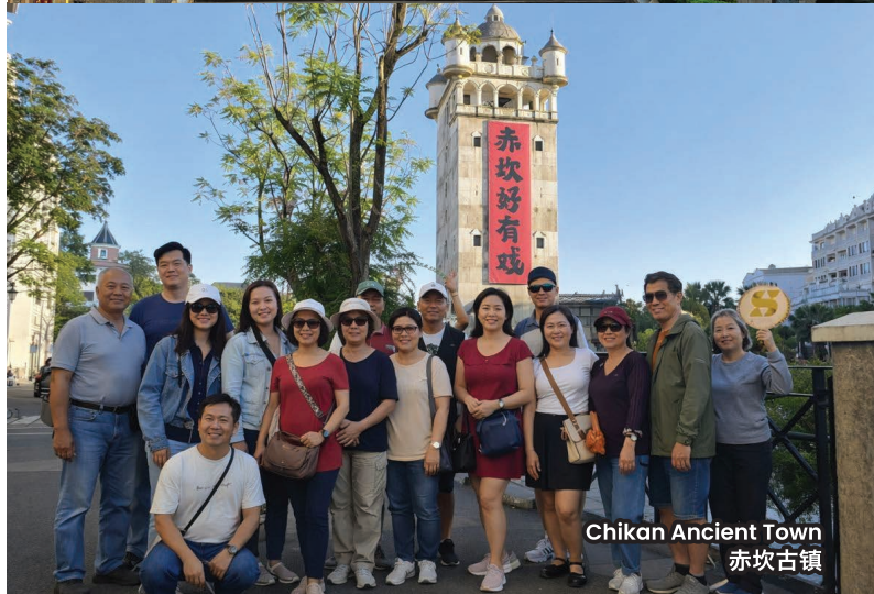
Chikan Ancient Town 赤坎古镇