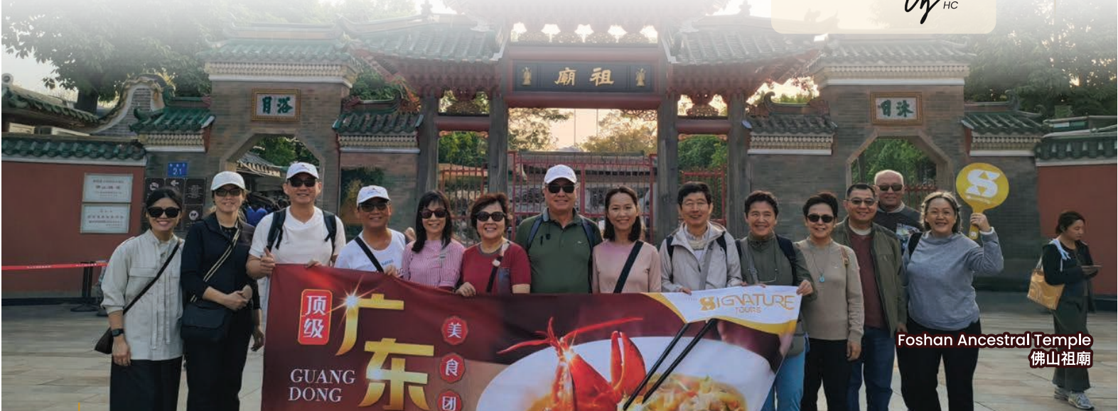
Foshan Ancestral Temple 佛山祖廟