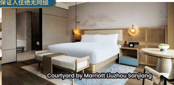
Courtyard by Marriott Liuzhou Sanjiang