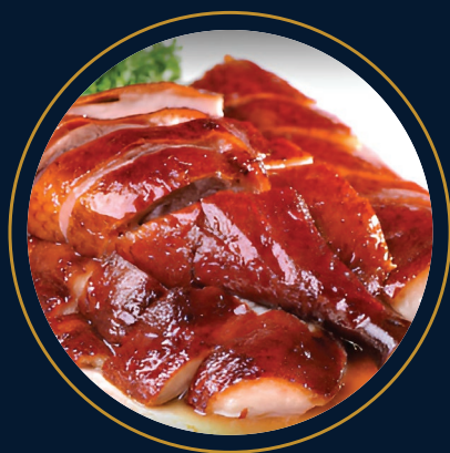
Roast Goose Cuisine 烧鹅风味

The outer skin is crispy, and the goose meat is tender and juicy. 外皮油脆，鹅肉细嫩多汁，而且肉汁香甜，鹅肉和皮之间有一层肥美的脂肪，油润而不肥腻。