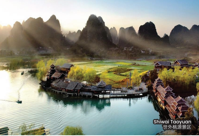
Shiwai Taoyuan 世外桃源景区