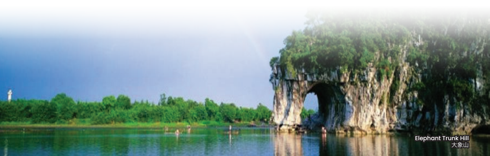
Elephant Trunk Hill 大象山

这是一趟专为追求品质旅行的您打造的旅程，让您从繁忙的生活中抽离，尽情享受大自然的静谧与壮丽。