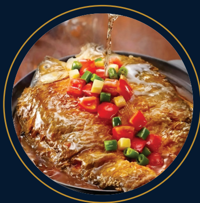
Beer Fish Flavor 啤酒鱼风味

The outer skin is crispy, and the goose meat is tender and juicy. 外皮油脆，鹅肉细嫩多汁，而且肉汁香甜，鹅肉和皮之间有一层肥美的脂肪，油润而不肥腻。