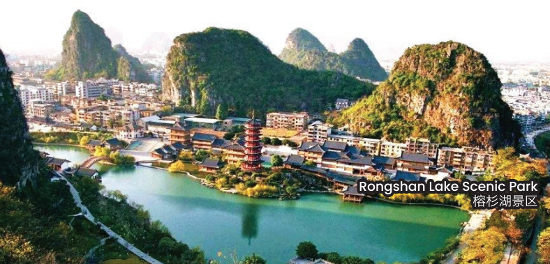
Rongshan Lake Scenic Park 榕杉湖景区