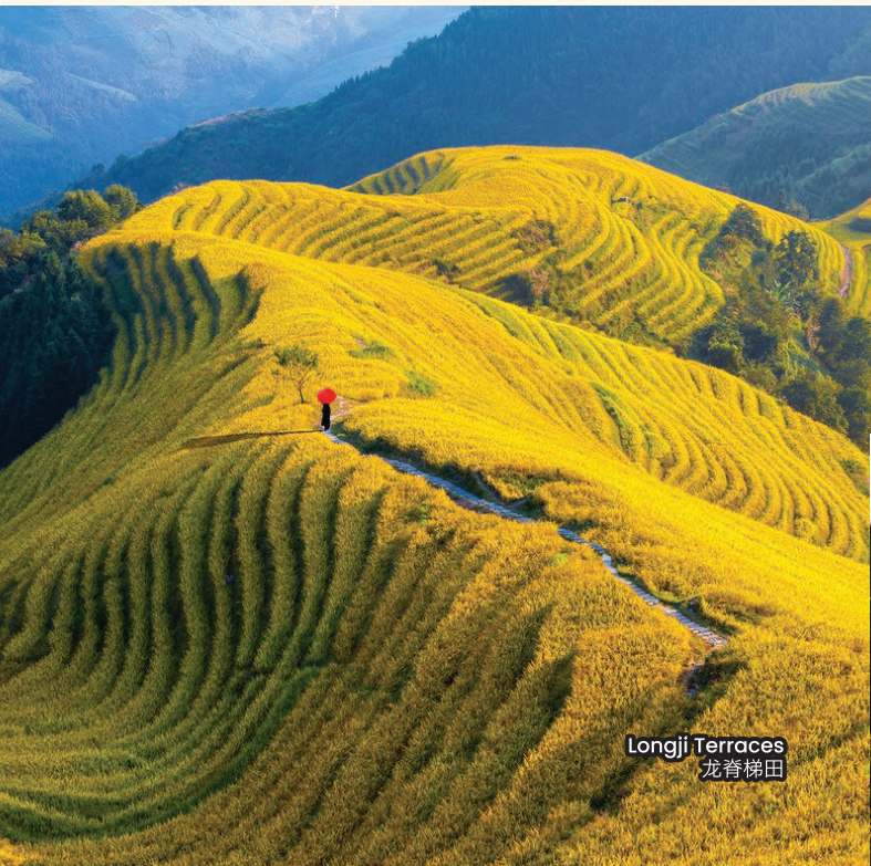
Longji Terraces 龙脊梯田

Disclaimer: Sequences of itinerary are subject to local arrangement. Itineraries, meals, hotels and transportation are subject to change without prior notice.