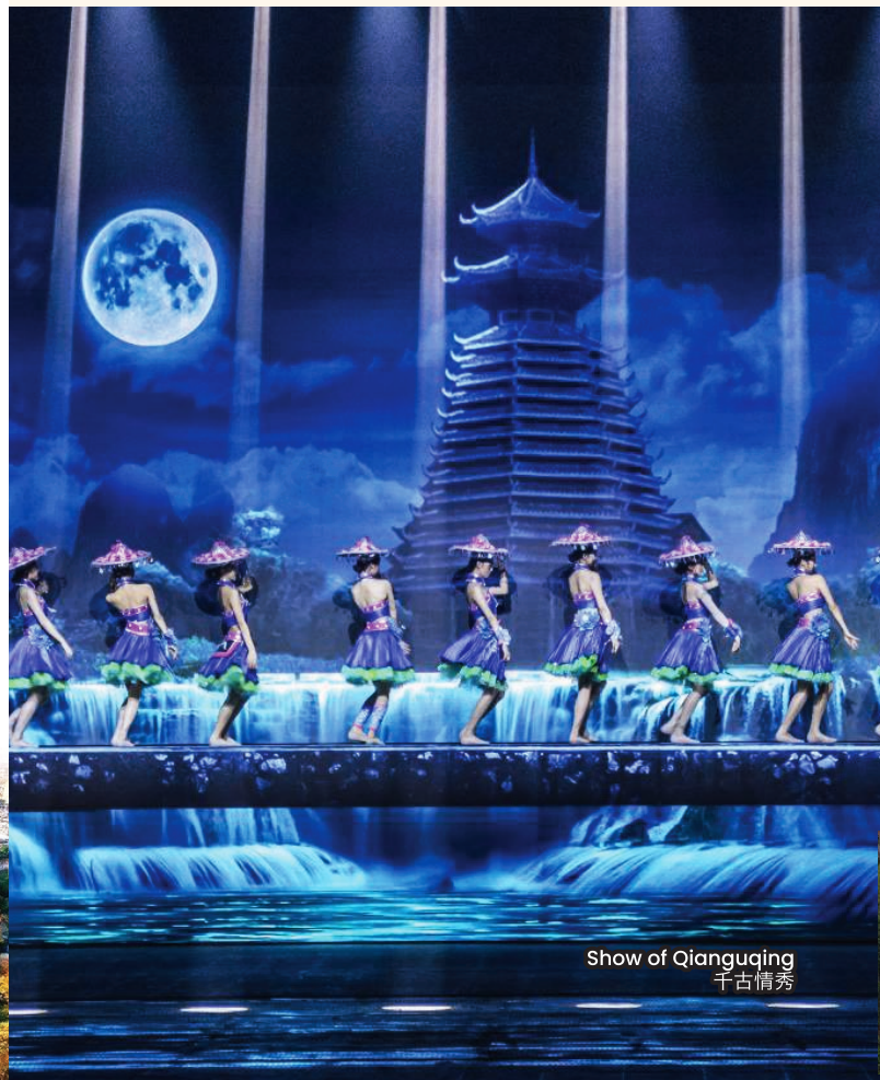
Show of Qianqunqing 千古情秀

行程次序以当地旅行社安排为准。行程, 膳食, 住宿, 交通等可能会因不可抗拒因素而更动, 恕不另行通知。