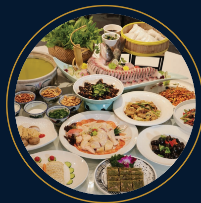
Li River Youcha Flavour 漓江油茶风味

This fish is braised with Guilin premium beer, imparting a unique, crispy, and fresh taste. 鱼放入桂林产的上等啤酒红焖而成，具有独特的香酥鲜嫩风味。