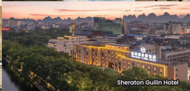
Sheraton Guilin Hotel