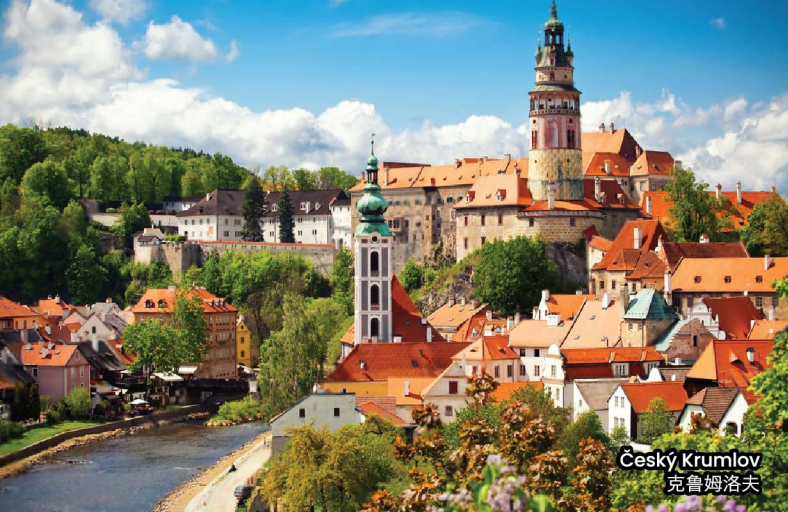
Český Krumlov 克鲁姆洛夫