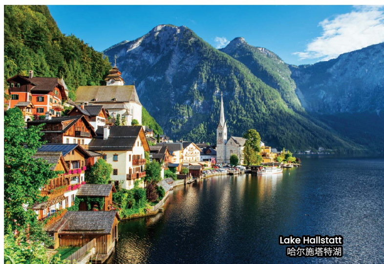
Lake Hallstatt 哈尔施塔特湖