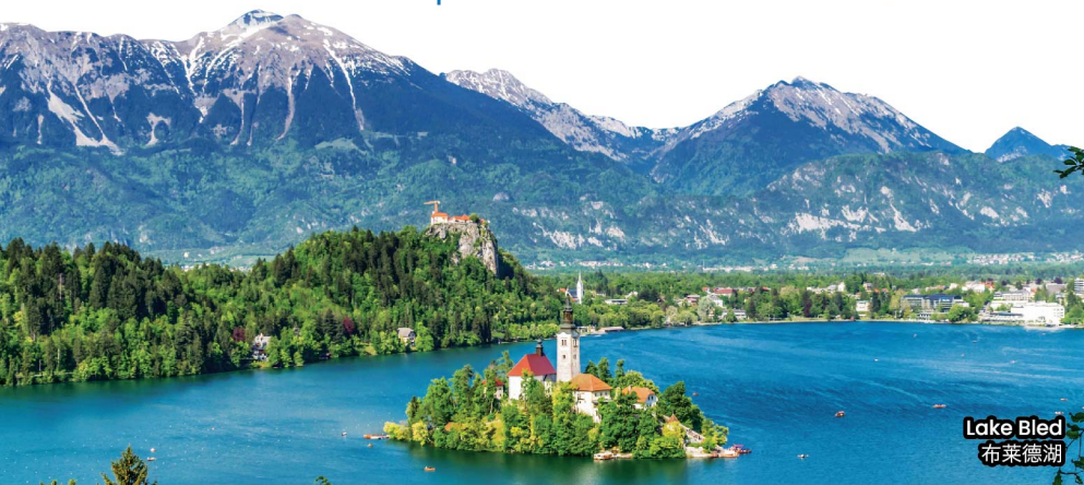
Lake Bled 布莱德湖