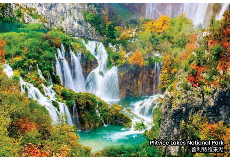
Plitvice Lakes National Park 普利特维采湖