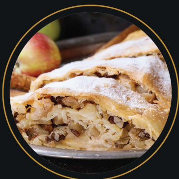
Viennese Apple Strudel