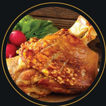
Crispy Pork Knuckle