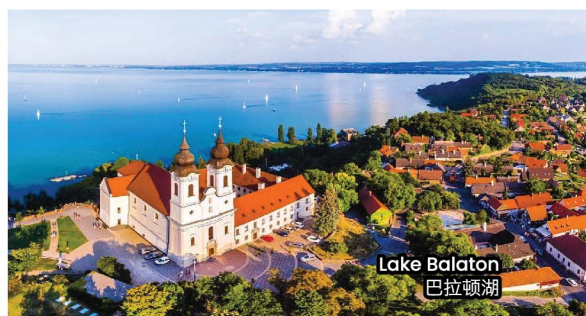
Lake Balaton 巴拉顿湖