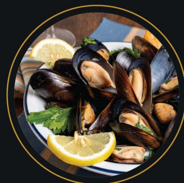
Mussels in a wine broth with garlic