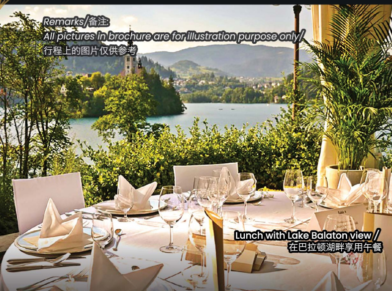
Lunch with Lake Balaton view // 在巴拉顿湖畔享用午餐

All pictures in brochure are for illustration purpose only/ 行程上的图片仅供参考