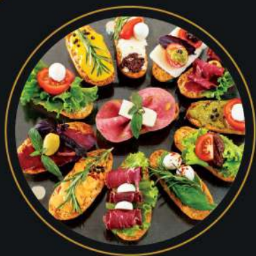
Premium Tapas 西班牙精致传统小吃