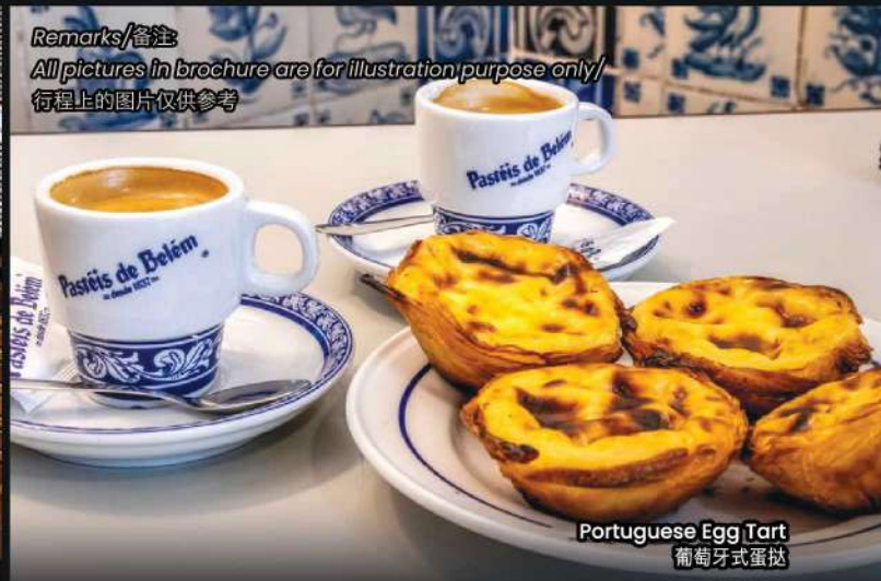
Portuguese Egg Tart 葡萄牙式蛋挞

Remarks/备注 All pictures in brochure are for illustration purpose only/ 行程上的图片仅供参考