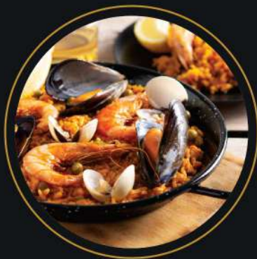
Seafood Paella 西班牙海鲜炖饭