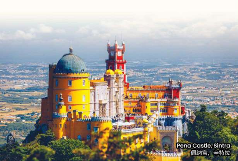
Pena Castle, Sintra 佩纳宫, 辛特拉