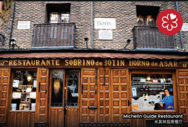
Michelin Guide Restaurant 米其林指南餐厅

Established in 1725, this Michelin Guide restaurant has been operating for more than 300 years and has been recognised by the Guinness Book of Records as the "oldest restaurant". 成立于1725年的米其林指南的餐厅至今已经连续运营了三百多年, 被吉尼斯纪录誉为“最古老的餐厅”。