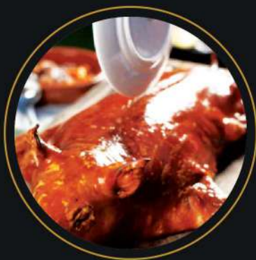
Segovia Suckling Pig 塞哥维亚烤乳猪