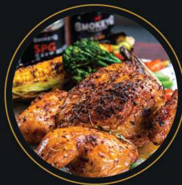
Peri-peri chicken 葡式烤鸡