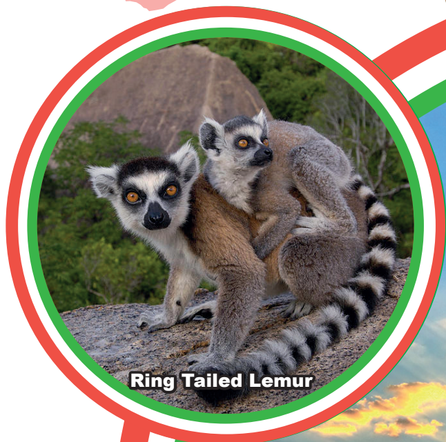
Ring Tailed Lemur