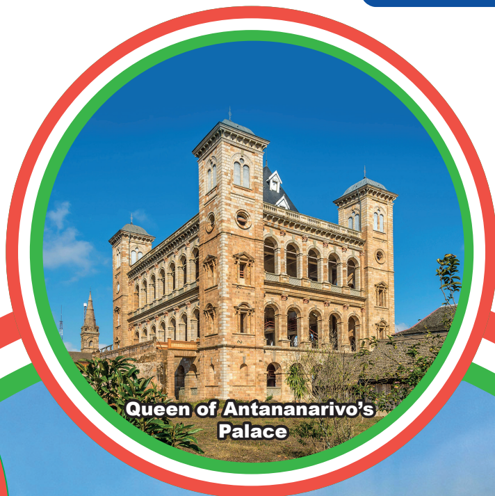
Queen of Antananarivo's Palace