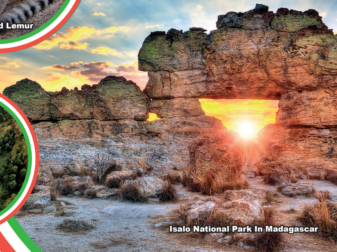
Isalo National Park In Madagascar