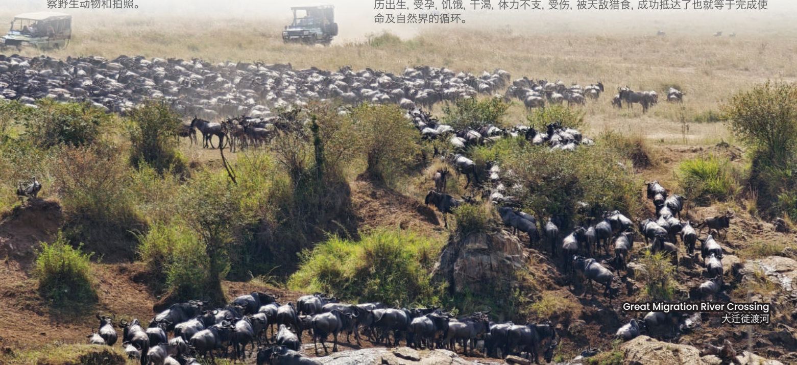
Great Migration River Crossing 大迁徙渡河

由司导开着敞篷的丰田陆地巡洋舰带领穿越野生动物的栖息地，以不干扰它们自然行为的情况下近距离观察野生动物和拍照。