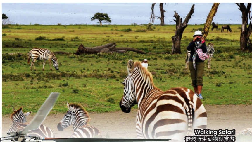
Walking Safari 徒步野生动物观赏游