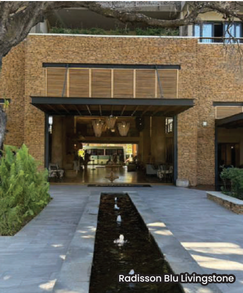
Radisson Blu Livingstone