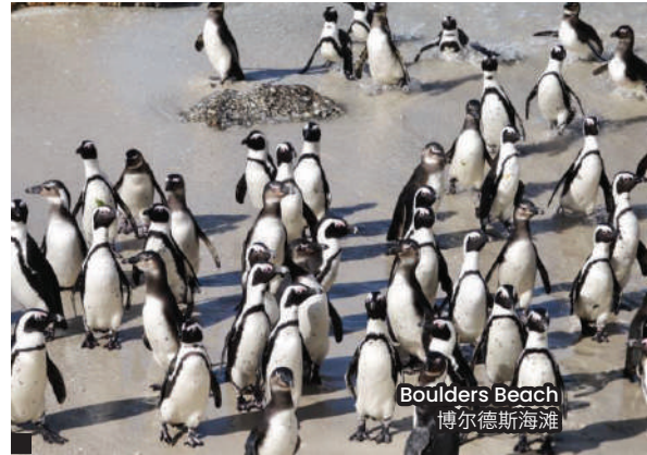
Boulders Beach 博尔德斯海滩