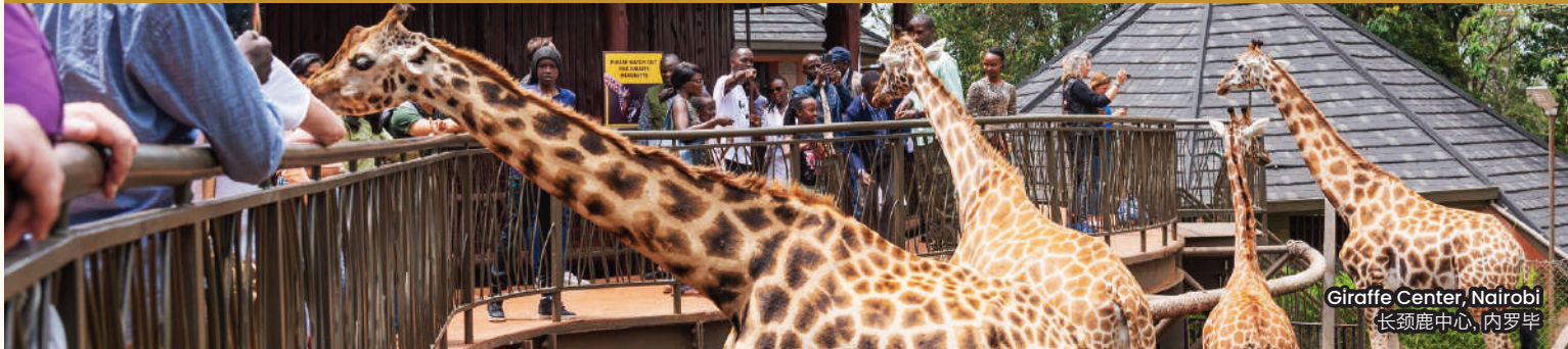
Giraffe Center, Nairobi 长颈鹿中心, 内罗毕

Total Stay: Kenya - 4 nights, Zimbabwe or Zambia - 3 nights, South Africa - 2 nights