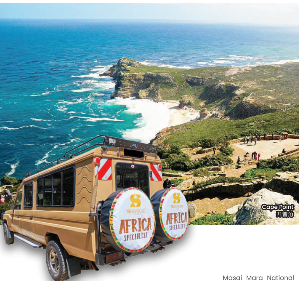
Cape Point 开普角