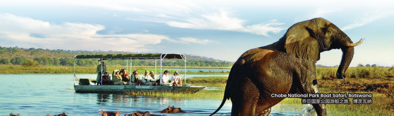
Chobe National Park Boat Safari, Botswana 乔贝国家公园游船之旅，博茨瓦纳