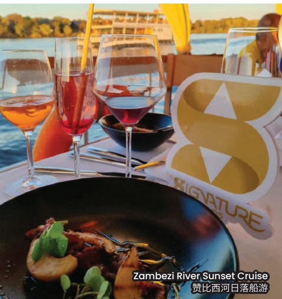
Zambezi River Sunset Cruise 赞比西河日落船游

Vibes to create joyful moment together 共创愉悦片刻