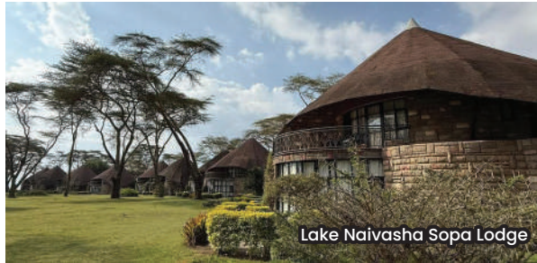
Lake Naivasha Sopa Lodge