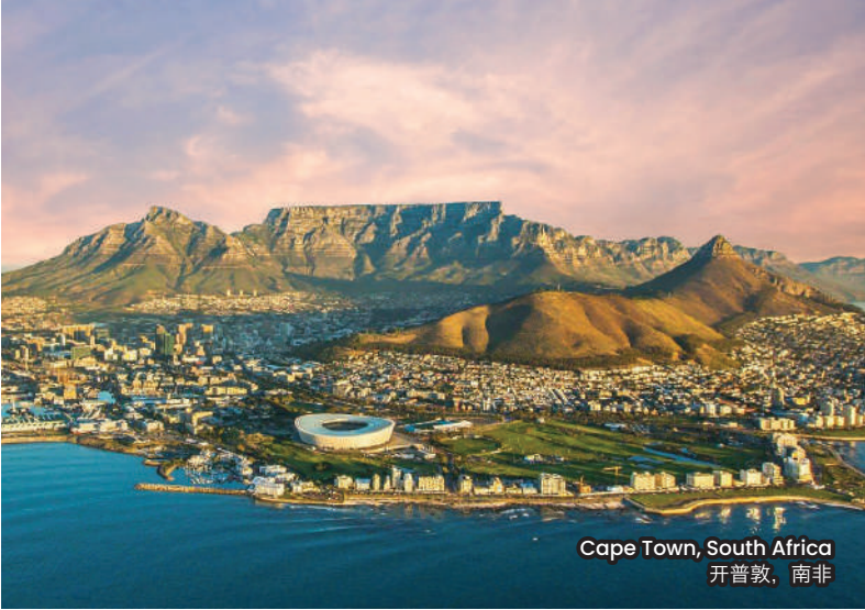
Cape Town, South Africa 开普敦, 南非