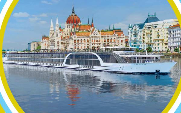
Danube River Cruise